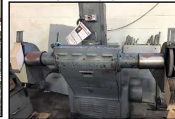
HAMMOND BUFFING MACHINE