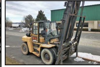
CATERPILLAR # DP-90 Diesel Forklift