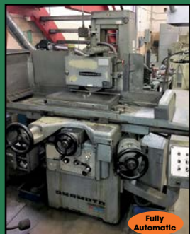
OKAMOTO # ACCUGAR-124N 12"x24" GRINDER