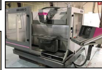
MAHO # MH-600C CNC MACHINING CENTER