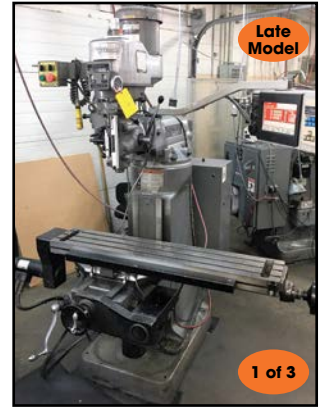
BRIDGEPORT # EZ-TRAK "2-Axis" CNC Knee Mill