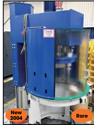
WALTHER TROWAL # MTMD 4/2-1 Finishing Machine