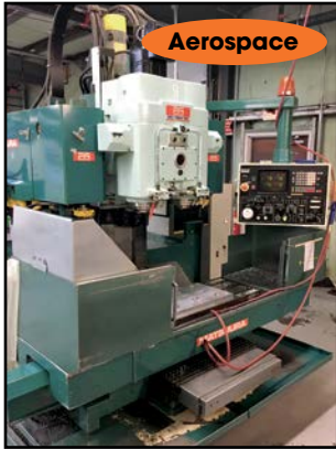
MATSUURA # MC-760V-DC "Twin Spindle" VMC