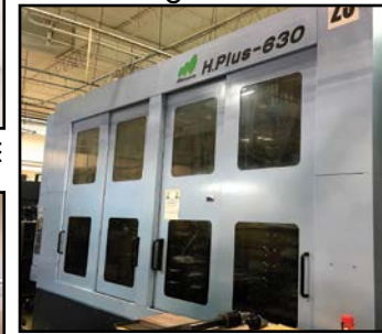
View of H-630 Plus 240 Tool ATC