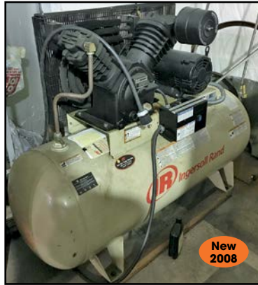
INGERSOLL-RAND AIR COMPRESSOR