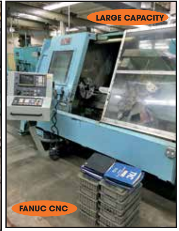
J&L # TNC "Heavy Duty" CNC LATHE