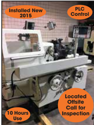
CHEVALIER # CGP-816 O.D. Grinder