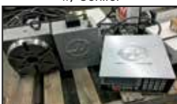
HAAS CNC "4th-Axis" ROTARY TABLE w/ Control