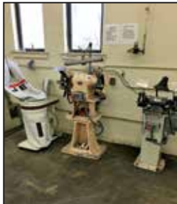
View of GRINDERS & DUST COLLECTOR