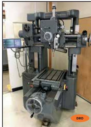
SIP # MP-3K "PRECISION" JIG BORER