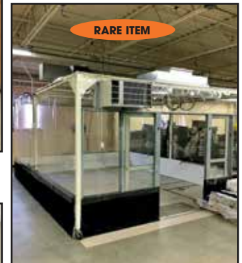
VIEW of PORTABLE CLEAN ROOM