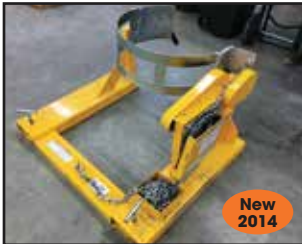
FORKLIFT BARREL CLAMP