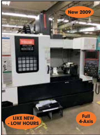
MAZAK # NEXUS 510C-II CNC VMC