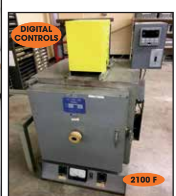
L&L # P-212H-C25 "DYNA-TROL" FURNACE