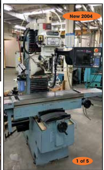
SWI-PROTO-TRAK # DPM-5 CNC BED MILL