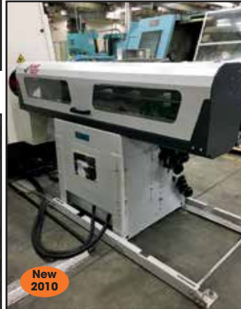
LNS # QUICK-LOAD BARFEED SYSTEM