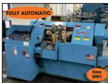
DO-ALL # C-305-A "AUTOMATIC" BAND SAW