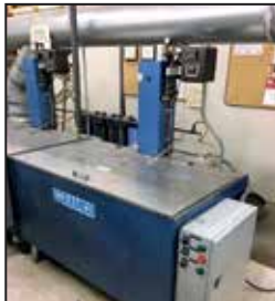
RAMCO S.S. PARTS CLEANING UNIT