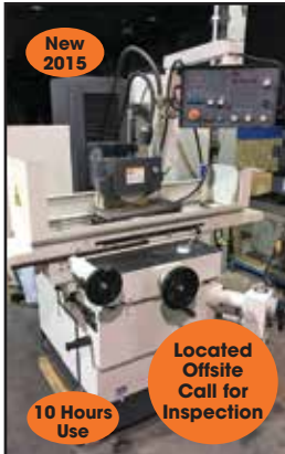
CHEVALIER # FSG-3A-818 Surface Grinder