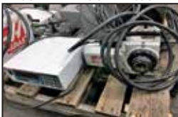
HAAS 5-C CNC INDEXER w/ Control