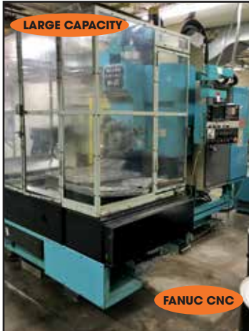
MAZAK # H-20 CNC HMC