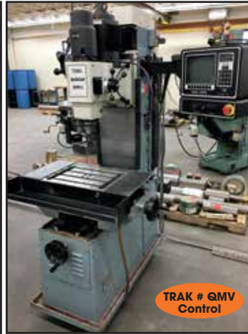
TRAK # QCM-1 "Quick-Cell" CNC MILL