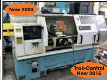
TRAK # TRL-1840V CNC LATHE w/ Power Turret