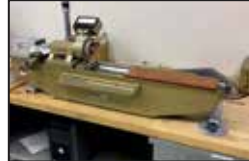
PRATT & WHITNEY "SUPER-MICROMETER"