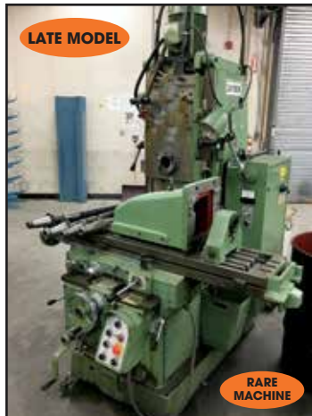
O.K.K. # MH-2P "UNIVERSAL" "Horizontal-Vertical" MILLER