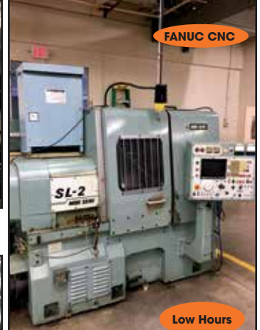
MORI-SEIKI # SL-2 CNC LATHE