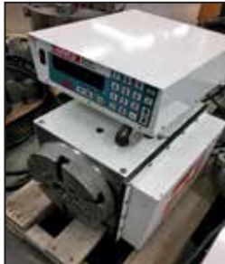
HAAS CNC "4th-Axis" ROTARY TABLE w/ Control