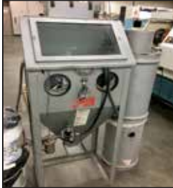
TRINCO SAND BLAST CABINET