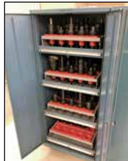
View of CNC LISTA TOOL STORAGE CABINET