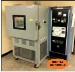
BLUE-M "Portable" OVEN