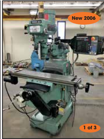
SWI PROTO-TRAK # K-3 CNC KNEE MILL