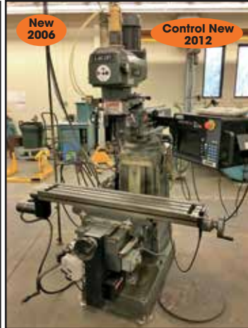
LAGUN KNEE MILL w/ TRAK CNC CONTROL