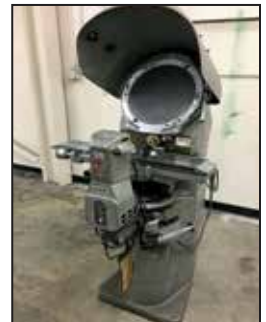
J&L 14" OPTICAL COMPARATOR