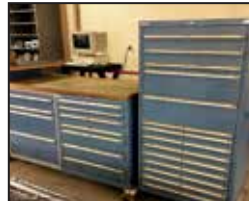
View of LISTA TOOL CABINETS