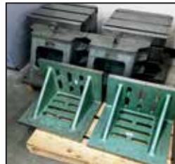
View of ANGLE PLATES