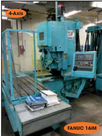
CINCINNATI # 10HC-1500 CNC HMC