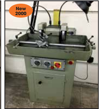
CLOTTU-MECANIQUE # AB-175 "PRECISION" DIAMOND TOOL GRINDER