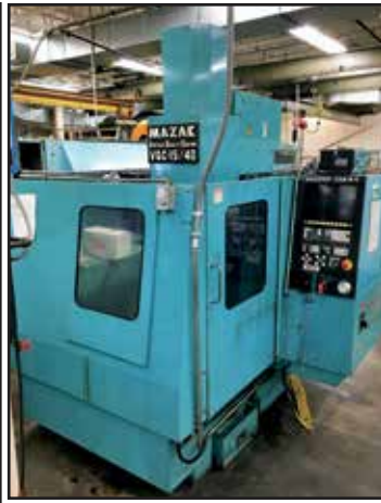
MAZAK # VQC-15/40 CNC VMC