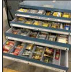
View of NEW CARBIDE INSERTS