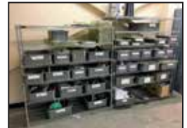
WIRE RACKS w/ PART TOTES