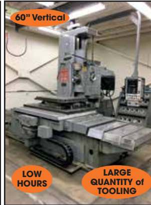
DeVLIEG # 4K-72 CNC "JIG-MILL"