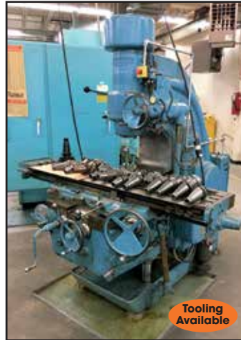
KEARNEY & TRECKER # 220-TF "TWIN-FEED" VERTICAL MILLER