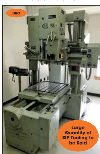
SIP # 5E "PRECISION" JIG BORER