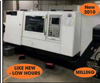
DMG-GILDEMEISTER # CTX-510 CNC TURNING CENTER