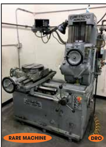
KEARNEY & TRECKER # "B" AUTO-METRIC BORING MILL