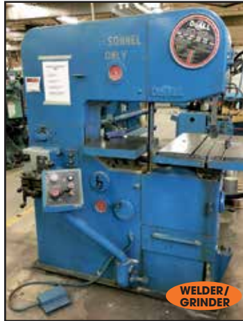
DO-ALL 36" HYD. VERTICAL BAND SAW