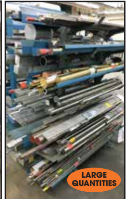
View of Raw Material