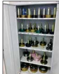
View of MASTER THREAD GAGES