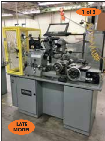
HARDINGE # HCT CHUCKER