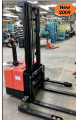
EP-EQUIPMENT 3,000 lb. ELECTRIC STACKER TRUCK