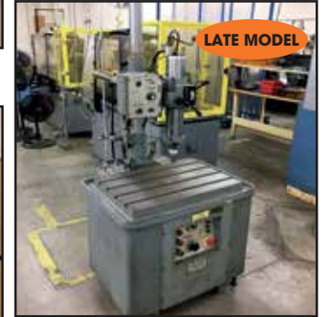
ELECTRO-ARC TAP DISINTEGRATOR