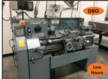
LEBLOND 15"x 30" TOOL ROOM LATHE