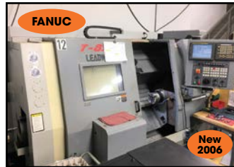
FANUC New 2006 LEADWELL # T-8SM CNC TURNING CENTER