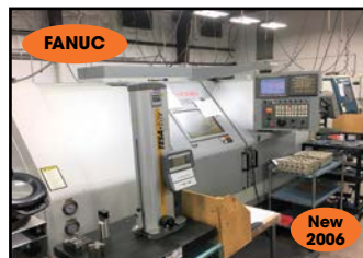
FANUC New 2006 LEADWELL # LTC-25BL CNC TURNING CENTER