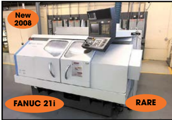
New 2008 FANUC 21i KELLENBERGER # KEL-VISTA 600/175 CNC GRINDER