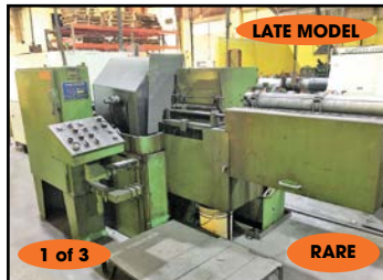
LATE MODEL 1 of 3 RARE KINEFAC # MC-5-F THREAD ROLLER