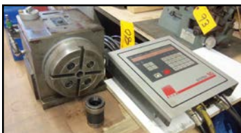
VIEW of SMW CNC INDEXER