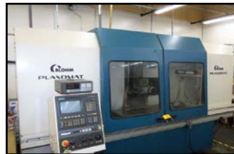
BLOHM # PLANOMAT 4-12 CNC GRINDER