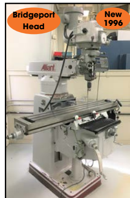
Bridgeport Head New 1996 ALLIANT #1054-3V VERTICAL MILLER