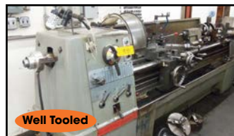
Well Tooled CLAUSING-COLCHESTER 17"x 80" ENGINE LATHE