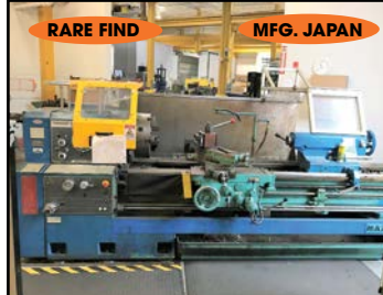
RARE FIND MFG. JAPAN MAZAK # 34-80 "HEAVY DUTY" ENGINE LATHE