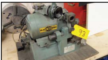
VIEW of BLACK DIAMOND DRILL GRINDER