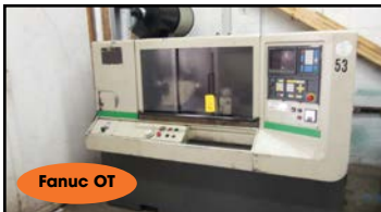
Fanuc OT HARDINGE # CHNC-I CNC LATHE