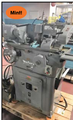
Mint! MYFORD 5"x 12" CYLIDRICAL GRINDER