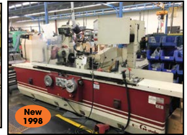
New 1998 STUDER 14"x 60" CYLINDRICAL GRINDER