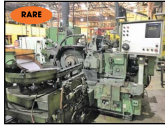
RARE CINCINNATI # 325-12 CENTERLESS GRINDER