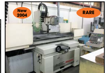
New 2004 RARE OKAMOTO # ACC-20-36EX CNC SURFACE GRINDER