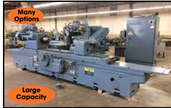
Many Options Large Capacity LANDIS 24"x 72" CYLINDRICAL GRINDER