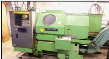
HITACHI-SEIKI # 4NE-600 CNC LATHE