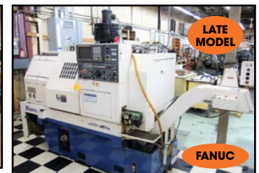
LATE MODEL FANUC MIYANO # BND-42S-5 CNC TURNING CENTER