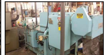
HYDRO-FLOW # HVF-12A COOLANT SYSTEM