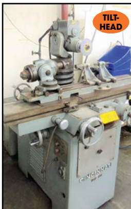
TILT-HEAD CINCINNATI # 2 TOOL & CUTTER GRINDER