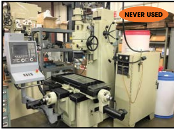
NEVER USED MOORE # G-18-8400CP CNC JIG GRINDER