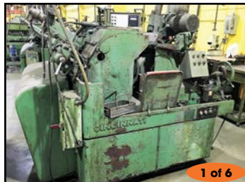
1 of 6 CINCINNATI # 2-OM CENTERLESS GRINDER