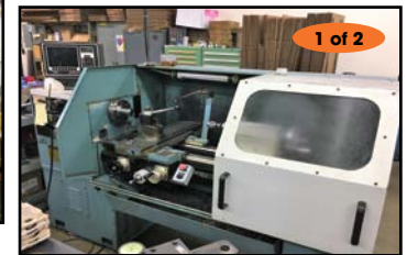
1 of 2 SWI-TRAK # TRL-1745 CNC LATHE