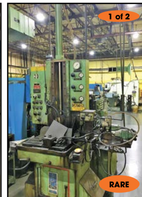
1 of 2 RARE ASTRO-B&H VERTICAL BROACH