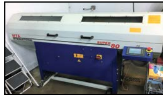
VIEW of BARFEED included w/ LEADWELL # T-8SM CNC TURNING CENTER