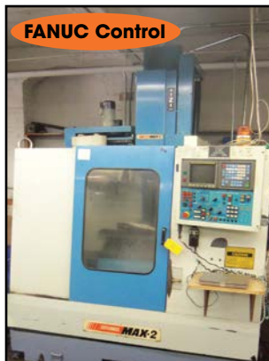
FANUC Control SUPERMAX #MAX-2 CNC VERT. MACHINING CENTER