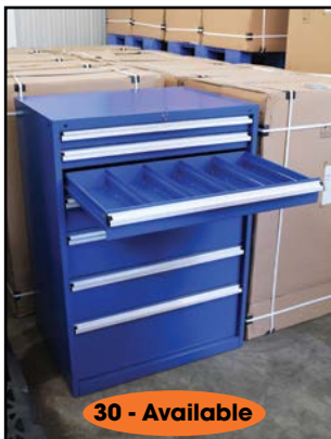
"BRAND NEW" LISTA TYPE TOOL STORAGE CABINETS