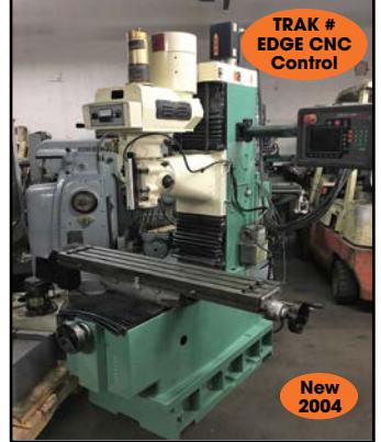
CHEVALIER # MC-3060 CNC Vertical Machining Center