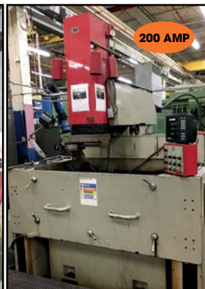
XERMAX "SINKER TYPE" EDM