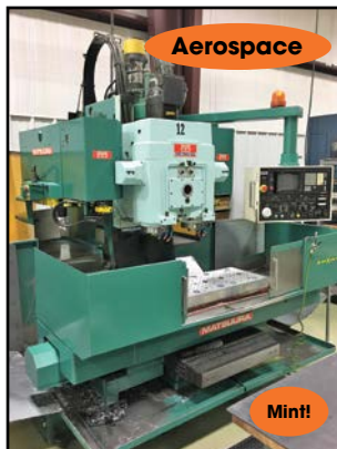
MATSUURA # MC-760V-DC "Twin Spindle" VMC