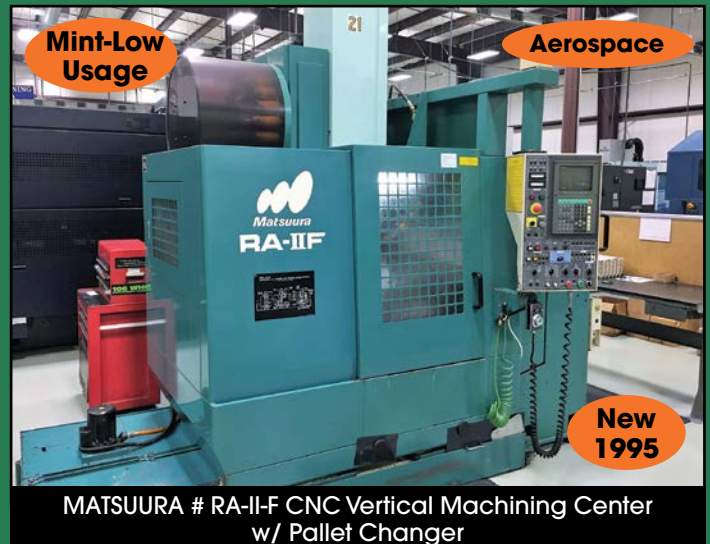
MATSUURA # RA-II-F CNC Vertical Machining Center w/ Pallet Changer

SALE DATE: THURSDAY, DECEMBER 14TH, 2017 1:00 PM (ET)