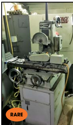
DEDTRU CENTERLESS GRINDER