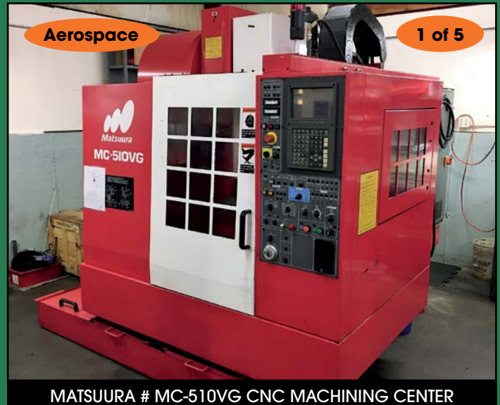
MATSUURA # MC-510VG CNC MACHINING CENTER