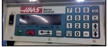
VIEW of HAAS ROTARY TABLE CONTROLS