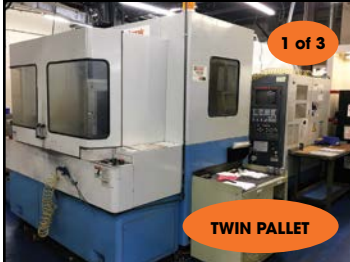
MAZAK # ULTRA-H-550X CNC HORIZONTAL MACHINING CENTER