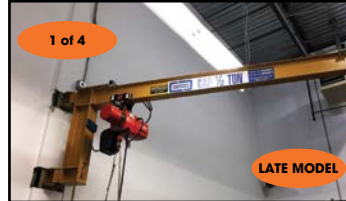
CONTRX JIB ARM w/ HOIST