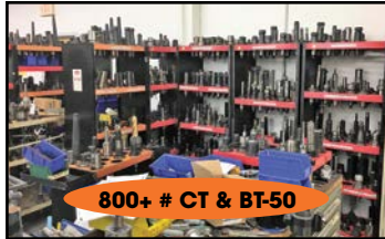
VIEW of CNC TOOL HOLDERS