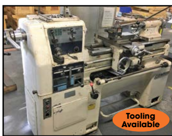
TAKISAWA ENGINE LATHE