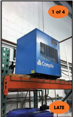
CompAir AIR DRYER