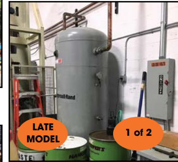
INGERSOLL-RAND AIR RECEIVER TANK