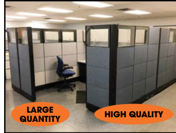
VIEW of MODERN OFFICE CUBICLE SUITES