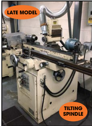
CINCINNATI # 2 TOOL & CUTTER GRINDER