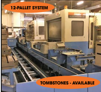
MAZAK # H-650 "PALLETECH" HORIZONTAL MACHINING CELL