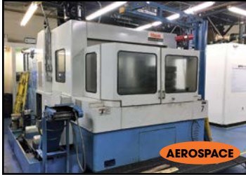
MAZAK # H-630N CNC HORIZONTAL MACHINING CENTER