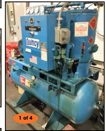
QUINCY # QST-15 (15 HP) AIR COMPRESSOR