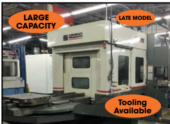
CINCINNATI-MILACRON # MAGNUM-800 CNC HORIZONTAL MACHINING CENTER