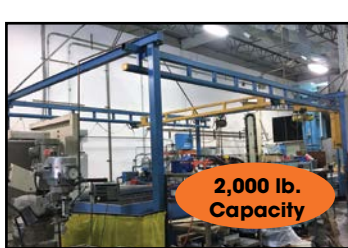
GORBEL MODULAR CRANE SYSTEM