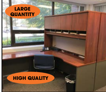
VIEW of MODERN MODULAR DESK