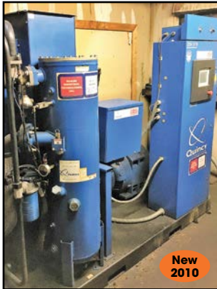
QUINCY # QSI-75 (75 HP) ROTARY AIR COMPRESSOR

INSPECTION DATE: TUESDAY, NOVEMBER 28TH (9:00 - 4:00)