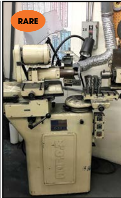
K.O. LEE # RT-300 RADIUS GRINDER