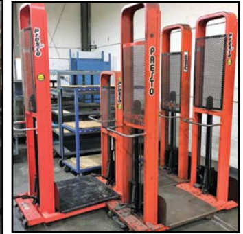
VIEW of PRESTO HYD. LIFT CARTS