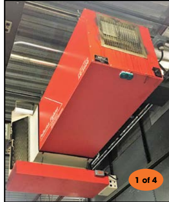
NORTHERN # AR-5000 MIST & DUST COLLECTOR