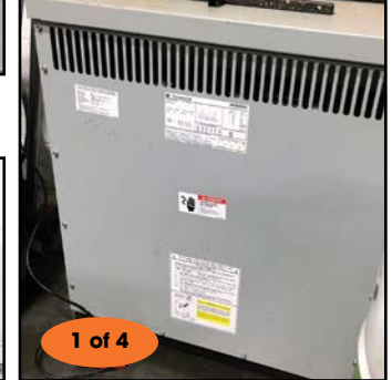
VIEW of TRANSFORMER