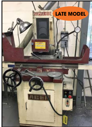
ACER # SUPRA-618 SURFACE GRINDER