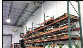
VIEW of H.D. RACK SHELVING