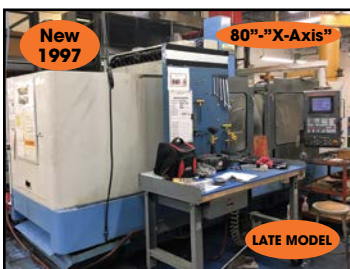
MAZAK # MTV-655/80 CNC VERTICAL MACHINING CENTER