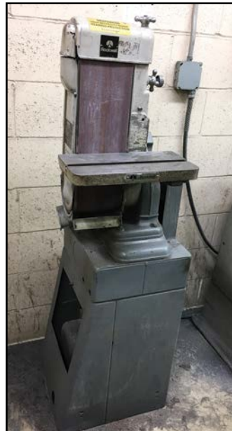
ROCKWELL 6" BELT GRINDER/SANDER