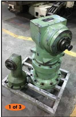
VIEW of G&L RIGHT ANGLE HEADS CABINETS