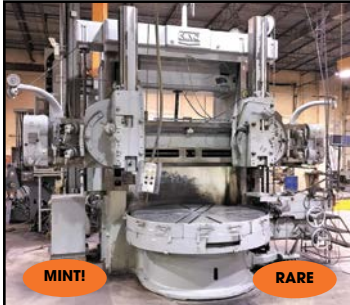
KING 72" VERTICAL BORING MILL