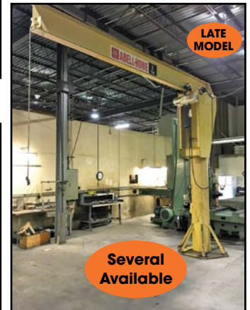
ABELL-HOWE 2-Ton JIB CRANE