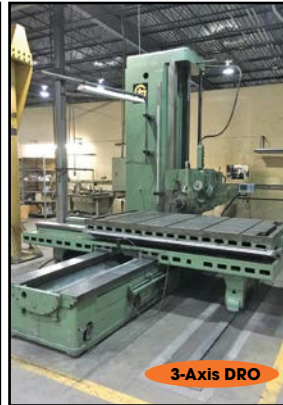
GIDDINGS & LEWIS # 70A-DP5-T HORIZONTAL BORING MILL