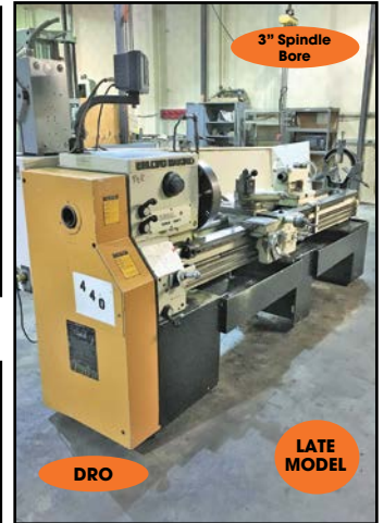
LEBLOND-MAKINO # REGAL-SHIFT 19"x 90" ENGINE LATHE