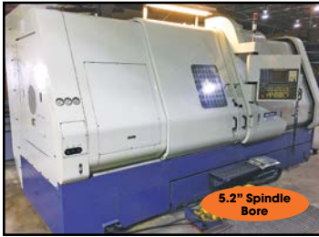
HWACHEON # HI-ECO-45 CNC TURNING CENTER