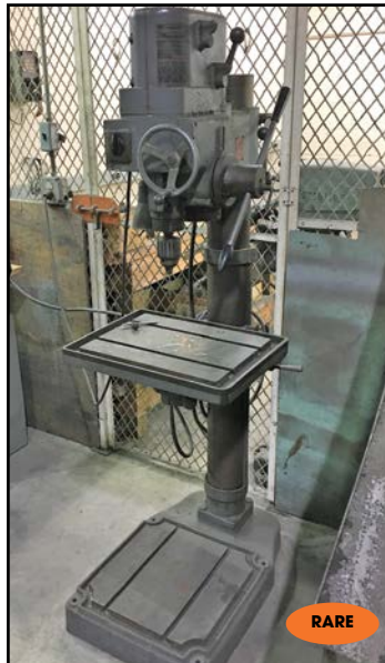
FLOOR TYPE GEARED HEAD DRILL PRESS