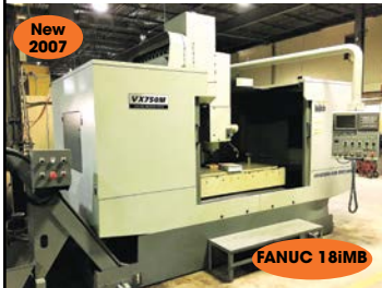
HYUNDIA-KIA # VX-750M CNC VERTICAL MACHINING CENTER