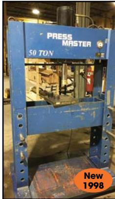
PRESS-MASTER 50 Ton HYD. SHOP PRESS