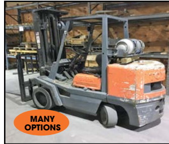
TOYOTA # FCG-45 (10,000 lb.) FORKLIFT