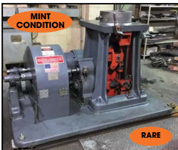
MITTS & MERRILL # 8-A "GIANT SERIES" KEYSATER