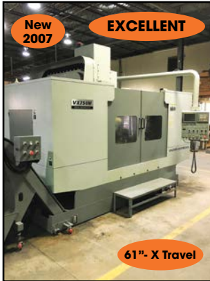
HYUNDA-KIA #VX-750M CNC VERTICAL MACHINING CENTER