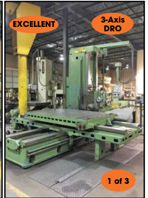
GIDDINGS & LEWIS # 70A-DP5-T HORIZONTAL BORING MILL