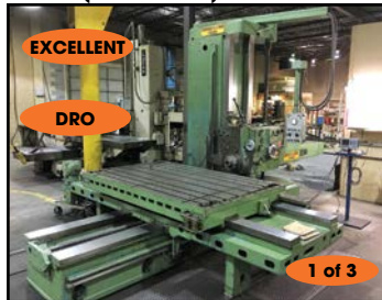
GIDDINGS & LEWIS # 70A-DP5-T HORIZONTAL BORING MILL