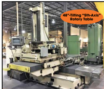
LUCAS # 20DCS-56 CNC "5-Axis" HORIZONTAL BORING MILL