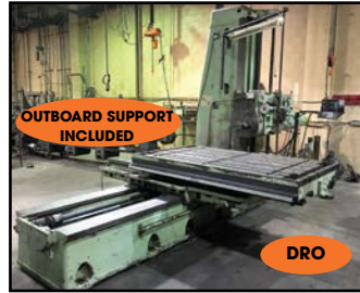
GIDDINGS & LEWIS # 350-T TABLE TYPE BORING MILL