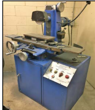
CHICAGO SURFACE GRINDER