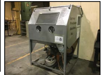
SAND BLAST CABINET