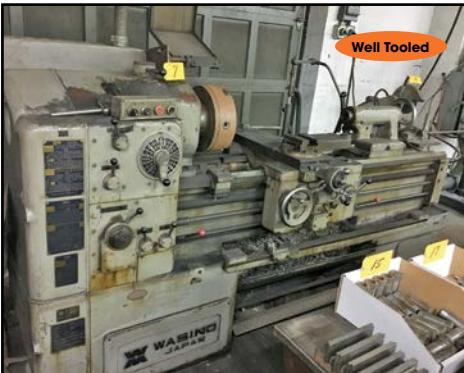
WASINO 20"x 50" ENGINE LATHE