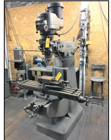
BRIDGEPORT 2 HP "Series-I" VERTICAL MILLER