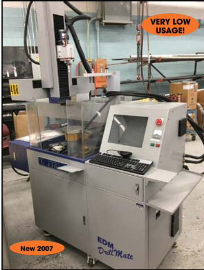
PERSEO-ERIE DRILL-MATE 430 EDM DRILL

SALE DATE: THURSDAY, NOVEMBER 8TH, 1:00 PM (ET)