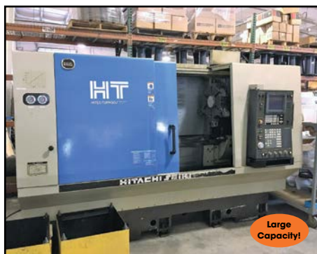
HITACHI-SEIKI #HT-30J CNC TURNING CENTER