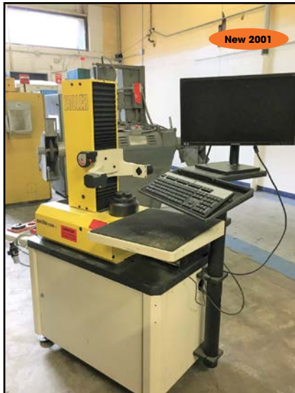
ZOLLER #SMILE-V300 CNC TOOL SETTER