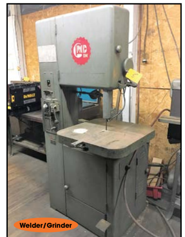
GROB #NS-18 VERTICAL BAND SAW