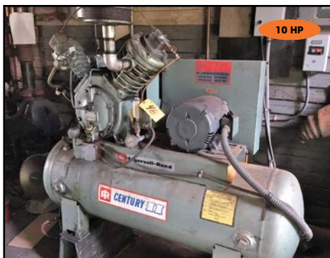
INGERSOLL-RAND "CENTURY-II" AIR COMPRESSOR