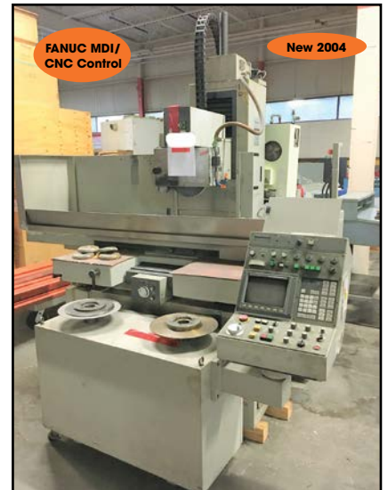
OKAMOTO # ACC-16-32-EXB CNC SURFACE GRINDER