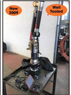
ROMER-HEXAGON # 5018 PORTABLE CMM

NOTICE: Some Machine Accessories & Fixtures in Photos may be SOLD separately. Please Inspect or View Final Lot Catalog for confirmation.