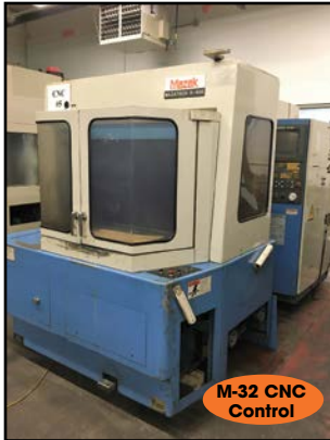
MAZAK # H-400 CNC HORIZONTAL MACHINING

Tuesday, August 21st , 9:00 - 4:00 (Seekonk Location ONLY) (ALL other item locations by Appointment ONLY)