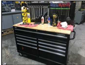
VIEW of HUSKY PORTABLE TOOL CHEST w/ Tools