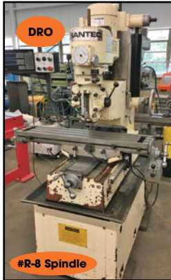
SANTEC TOOL ROOM BED MILL