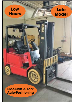
YALE # GLC-050 PROPANE FORKLIFT