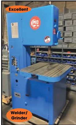
GROB # NV-18 VERTICAL BAND SAW