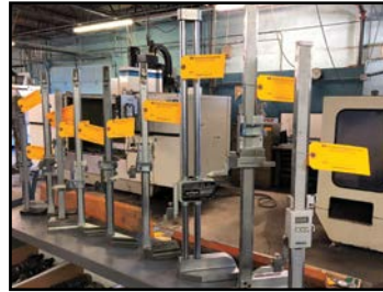
VIEW of INSPECTION ITEMS