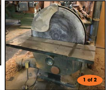
VIEW of HEAVY DUTY DISC SANDER