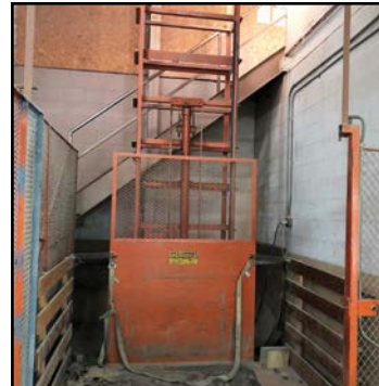
VIEW of 3,000 Lb. Cap. ELEVATOR