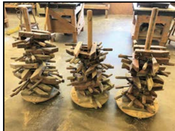
VIEW of WOOD WORKING CLAMPS