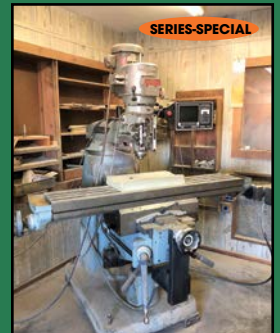
BRIDGEPORT 2 HP CNC (PROTO-TRAK) VERTICAL MILLER