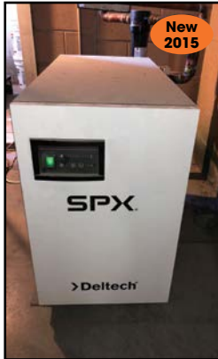
DELTECH-SPX AIR DRYER