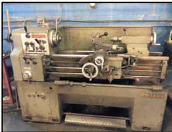
GOODWAY # GW-1433 ENGINE LATHE