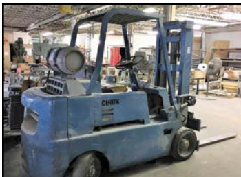
CLARK # CH-80 (8,000 lbs) FORKLIFT