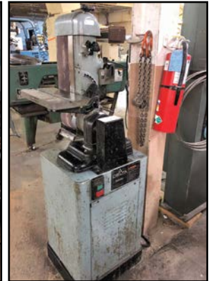
DELTA BELT SANDER