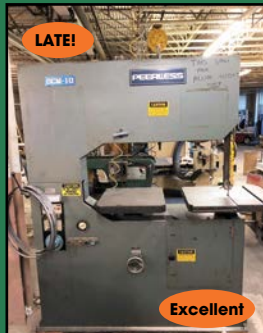
PEERLESS VERTICAL BAND SAW