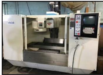
FADAL #VMC-4020 CNC VERTICAL MACHINING CENTER