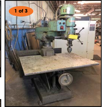
JOHANSSON RADIAL DRILL PRESS