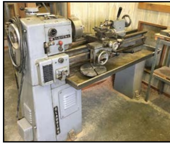
CLAUSING TOOL ROOM LATHE