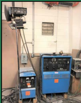
VIEW of MILLERS WELDERS

Inspection Date: Tuesday, November 13th, (9:00 - 4:00)