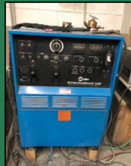
MILLER #SYNCROWAVE-500 WELDER