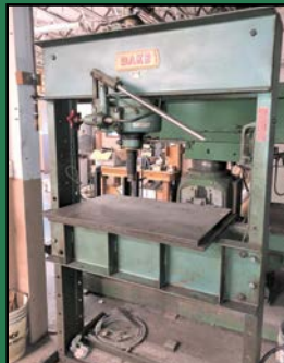
DAKE HYD. SHOP PRESS