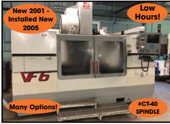
HAAS # VF-6 CNC VERTICAL MACHINING CENTER