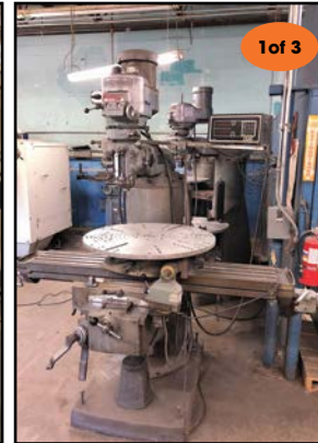
BRIDGEPORT 2 HP "SERIES-SPECIAL" VERTICAL MILLER