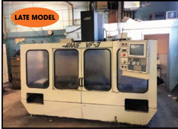
HAAS # VF-3 Vertical Machining Center