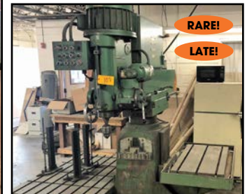
HTC DUAL-TABLE RADIAL DRILL