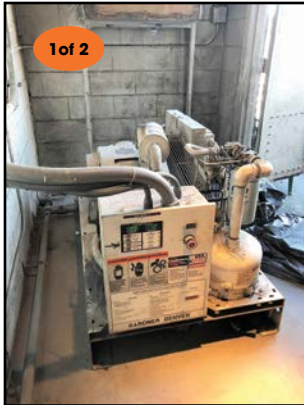
GARDNER-DENVER AIR COMPRESSOR

INSPECTION DATE: Tuesday, November 13th, (9:00 - 4:00)