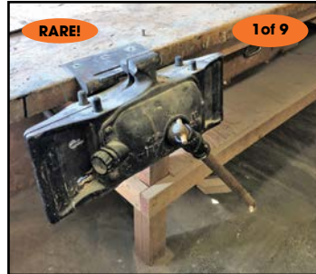
VIEW of HEAVY DUTY WOOD-WORKING VISE