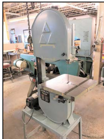
DELTA VERTICAL BAND SAW