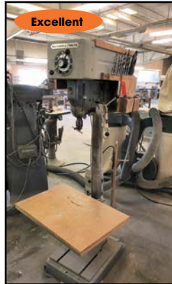
ROCKWELL FLOOR TYPE DRILL PRESS