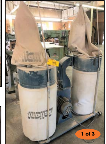
VIEW of RELIANT DUST COLLECTORS