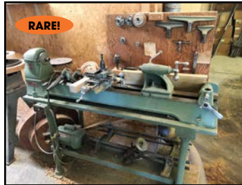
DELTA WOOD-WORKING LATHE