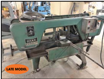
DAKE-JOHNSON # JH-10 BAND SAW