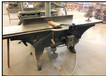
VIEW of HEAVY DUTY JOINTER