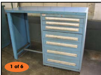
VIEW of H.D. TOOL CABINET