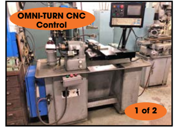
OMNI-TURN CNC Control HARDINGE # DV-59 CNC LATHE w/ CNC Control