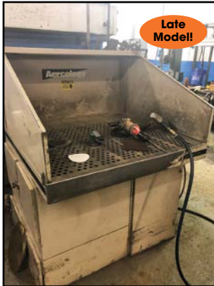
AERCOLOGY DOWN-DRAFT WORK BENCH

INSPECTION DATE: Tuesday, January 22nd, (9:00 - 4:00)