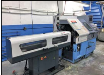
VIEW of LNS # ALPHA-SL-65S "SPACE-SAVER" BAR-FEED SYSTEMS