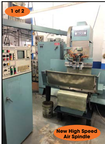
1 of 2 New High Speed Air Spindle BOSTO-MATIC # 300 CNC VERTICAL MACHINING CENTERS