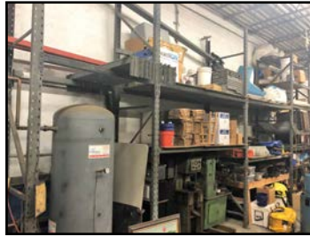
VIEW of H.D. RACK SHELVING