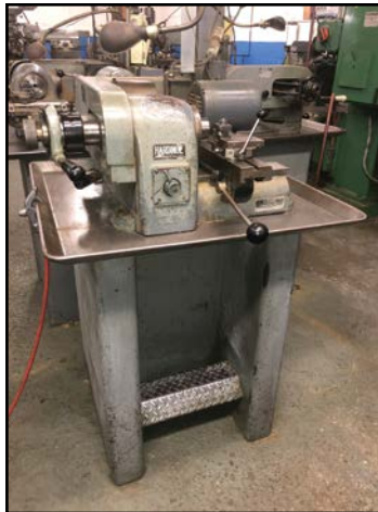
HARDINGE #HSL SPEED LATHE