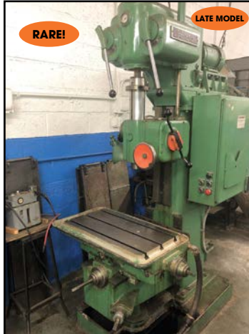
RARE! LATE MODEL CLEERMAN # DC-25 "SLIDING-HEAD" LAYOUT DRILL PRESS