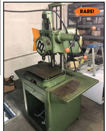
RARE! BURGMASER # 1-D TURRET DRILL