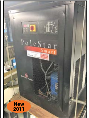
DOMNICK # DRD-250 "Smart-Polestar" AIR DRYER