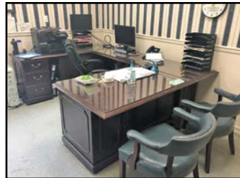
VIEW of EXECUTIVE OFFICE FURNITURE