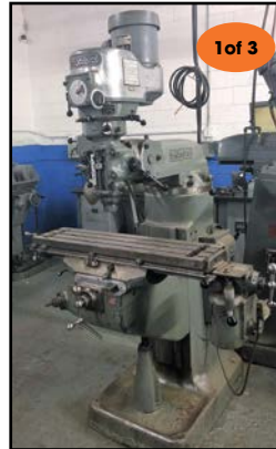
BRIDGEPORT 1.5 HP VERTICAL MILLER