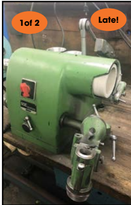
DECKEL # SOE "PRECISION" RADIUS TOOL & CUTTER GRINDER