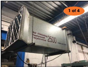
VIEW of MIST COLLECTOR