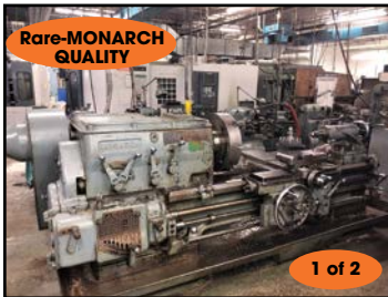
Rare-MONARCH QUALITY MONARCH 24.5"x 48" H.D. ENGINE LATHE