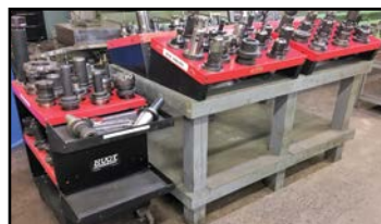
VIEW of #CT-50 & #CT-40 CNC TOOL HOLDERS