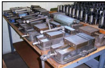
VIEW of CNC TOOLING & VISES