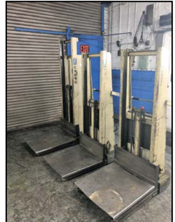
VIEW of PORTABLE LIFT CARTS