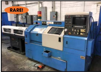
RARE! MAZAK # QUICK-TURN-15N CNC CHUCKER