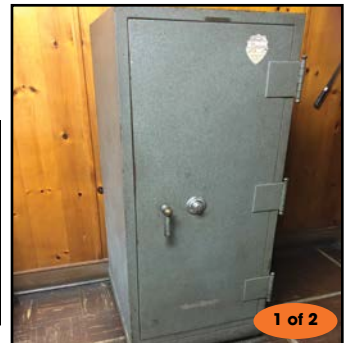
VIEW of SAFE