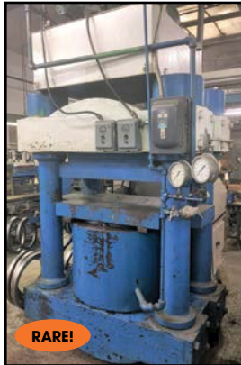
HYDRAULIC PRESS CORP. 600-Ton "4-POST" HYD. PRESS