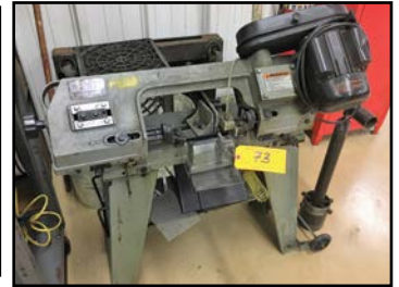
BLACK-BULL PORTABLE BAND SAW