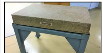
VIEW of STARRETT "PINK" GRANITE SURFACE PLATE