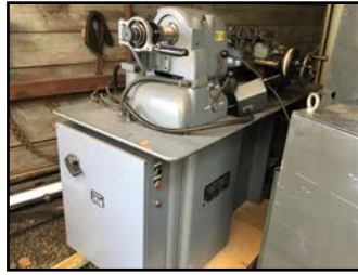
HARDINGE # HC HAND CHUCKER