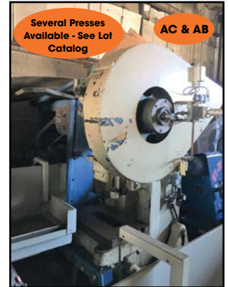
MINSTER 45-Ton OBI PUNCH PRESS