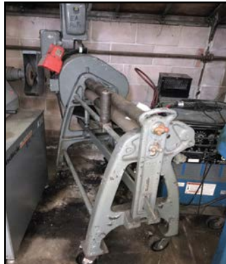
VIEW of PORTABLE POWER ROLLS