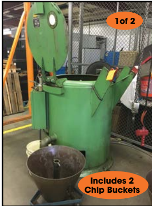
BARRETT # 401 CHIP SPINNER CENTRIFUGE