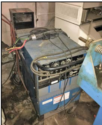
MILLER # SYNCROWAVE-250 WELDER