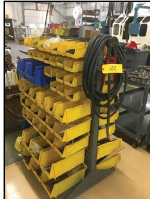
AKRO-BIN PORTABLE PARTS & TOOL CART