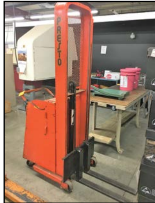
PRESTO PORTABLE ELECTRIC LIFT