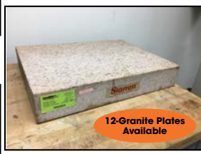
12-Granite Plates Available STARRETT PINK GRANITE PLATE