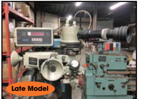
Late Model VIEW of OPTIDRESS WHEEL DRESSER