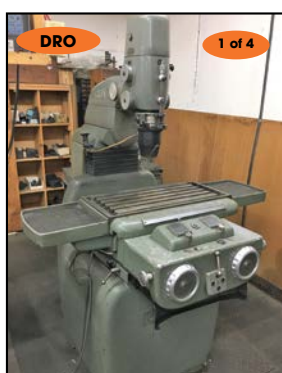
DRO 1 of 4 DECKEL JIG GRINDER