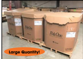
Large Quantity! VIEW of (NEW) PLASTIC RESIN