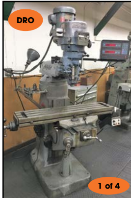
BRIDGEPORT 2HP "SERIES-I" VERTICAL MILLING MACHINE