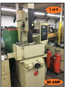
1 of 5 30 AMP ELTEE-PULSTRON # TRM-21 "SINKER TYPE" EDM