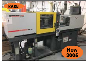
RARE! New 2005 MILACRON-FANUC #ROBOSHOT-S-2000-SiB-33 INJECTION MOLDING MACHINE