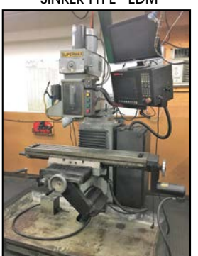
DRO SUPERMAX-YCM CNC KNEE MILLING MACHINE