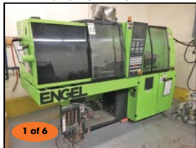
1 of 6 ENGEL 50 TON INJECTION MOLDER