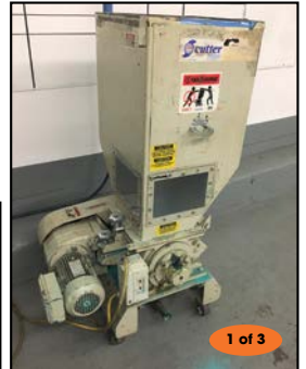
1 of 3 NISSUI PORTABLE PLASTIC GRANULATOR