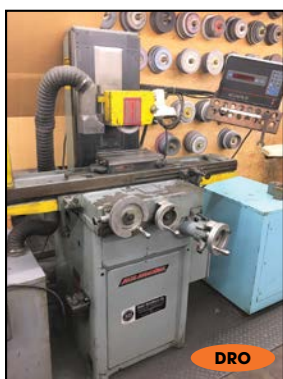
DRO REID 6"x 18" SURFACE