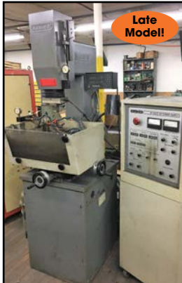
HANSVEDT "SINKER TYPE" EDM