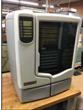
STRATASYS #U-PRINT 3D PRINTER