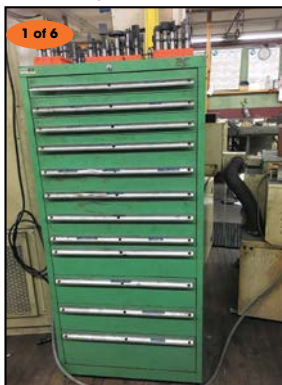
1 of 6 VIEW of LISTA TOOL CABINET