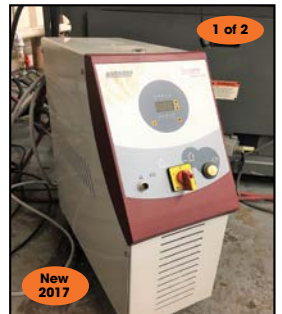
1 of 2 New 2017 WITTMANN TEMPERATURE CONTROL UNIT