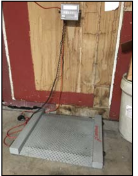
VIEW of CARDINAL DIGITAL PLATFORM SCALE