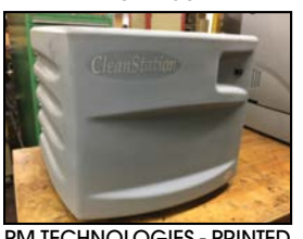
PM TECHNOLOGIES - PRINTED PARTS CLEAN STATION