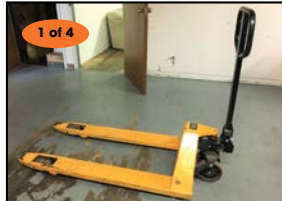
1 of 4 VIEW of HYD. PALLET JACK