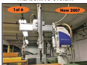
1 of 6 New 2007 YUSHIN "PICK & PLACE" ROBOTS