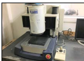
1 of 6 SMARTSCOPE # FLARE VIDEO MEASURING SYSTEM