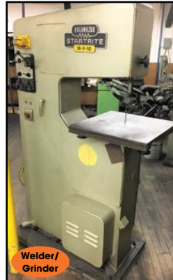
KALAMAZOO-STARTRITE # 18-V-10 VERTICAL BAND SAW