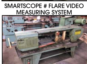
DO-ALL # C-916 HORIZONTAL BAND SAW