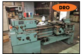
DRO VIEW of TOS 20"x 40" ENGINE LATHE