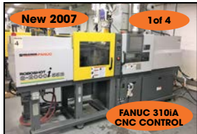
New 2007 1 of 4 FANUC 310iA CNC CONTROL MILACRON-FANUC #ROBOSHOT-S-2000i-55B INJECTION MOLDING MACHINE