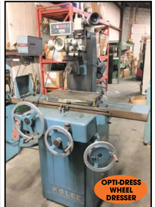
K.O. LEE 6"x 18" SURFACE GRINDER