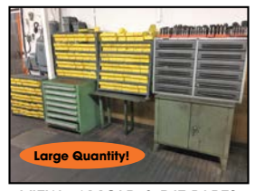
VIEW of MOLD & DIE PARTS & COMPONENTS Large Quantity!