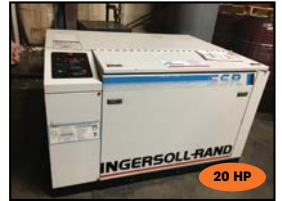
INGERSOLL-RAND #SSR ROTARY SCREW AIR COMPRESSOR 20 HP