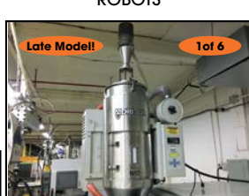
Late Model! 1 of 6 DRI-AIR PLASTIC DRYER SYSTEM