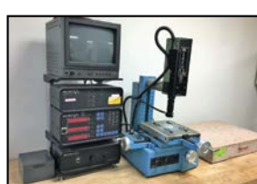
MICRO-VU # CX-6 VIDEO MEASURING SYSTEM