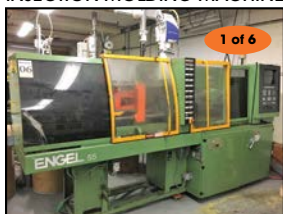
1 of 6 ENGEL 50 TON INJECTION MOLDER