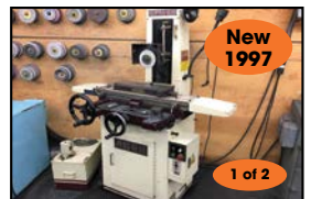
New 1997 1 of 2 ACER # SUPRA-618 SURFACE GRINDER