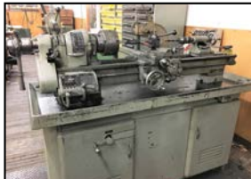
SOUTH BEND TOOL ROOM LATHE