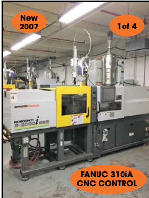
MILACRON-FANUC #ROBOSHOT-S-2000I-55B INJECTION MOLDING MACHINE

INSPECTION DATE: TUESDAY, May 21st, 9:00 - 4:00 PM