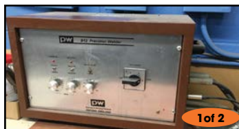
PW # B-12 PRECISION WELDER