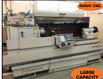
HARRISON # ALPHA-550-PLUS CNC LATHE