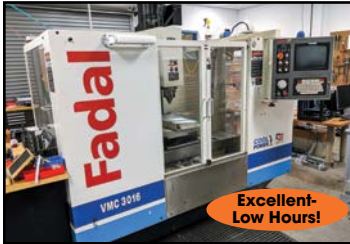
FADAL # 3016 CNC VERTICAL MACHINING CENTER