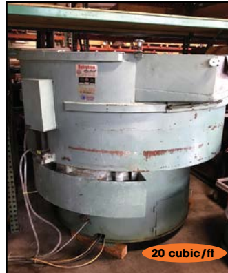
ROTO-FINISH "SPIROTRON" FINISHING MACHINE