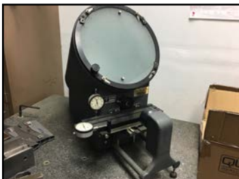
MICRO-VU 12" OPTICAL COMPARATOR