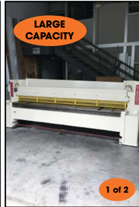
NIAGARA 10' x 1/4" POWER SHEAR