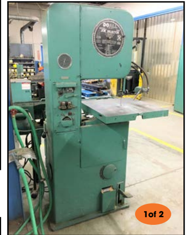
DO-ALL 16" VERTICAL BAND SAW