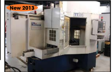
MILLTRONICS # TT-24 VERTICAL MACHINING CENTER