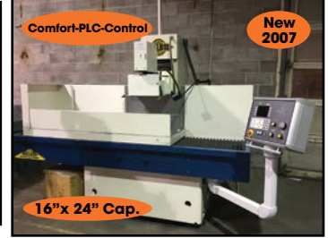
ELB # SMART-LINE-6 SURFACE GRINDER