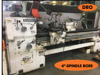
SUMMIT 19"/27"x 80" "GAP TYPE" ENGINE LATHE