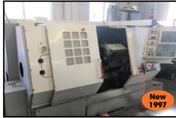
HAAS # HL-2 "BIG BORE" CNC TURNING CENTER