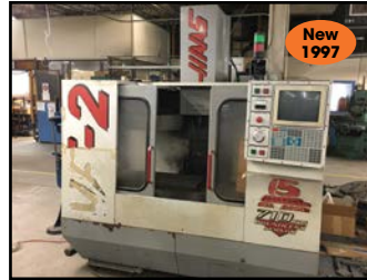
HAAS # VF-2 CNC VERTICAL MACHINING CENTER