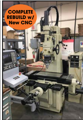
MOORE # G-18-CP-840 CNC JIG GRINDER