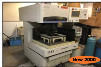
MITSUBISHI # RA-90 CNC WIRE EDM