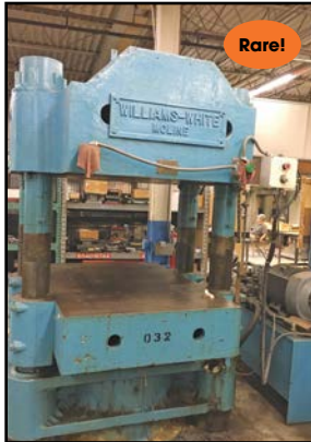
WILLIAMS & WHITE 600-Ton HYD. PRESS