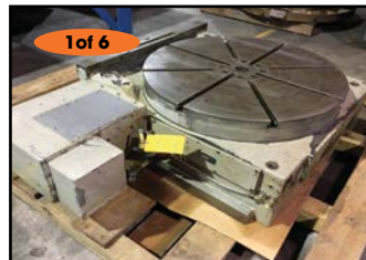
VIEW of TSUDAKOMA CNC ROTARY TABLE