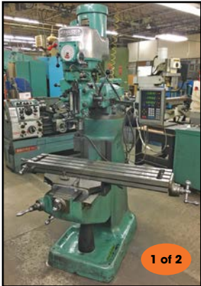
BRIDGEPORT MILLING MACHINE