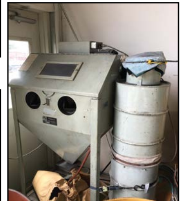
TRINCO # BP-30 BLAST CABINET