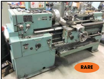
TOS # SN-40-B 16"/23.5"x 40" "GAP TYPE" ENGINE LATHE