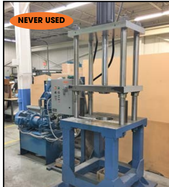
VIEW of 4-POST HYD. "TRY-OUT" PRESS