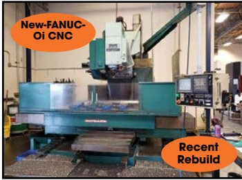
MATSUURA # MC-2000V VERTICAL MACHINING CENTER