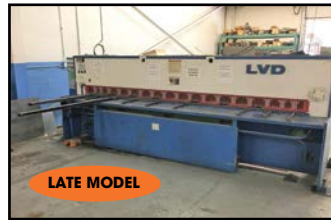
LVD 10'x 1/4" POWER SHEAR