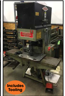
METAL-MUNCHER # MM-70 IRON-WORKER