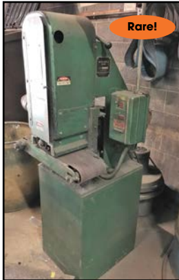
TIMESAVER # MINI-BELT-648 BELT GRINDER- SANDER