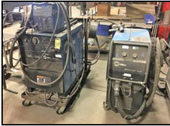
VIEW of MILLER WELDERS