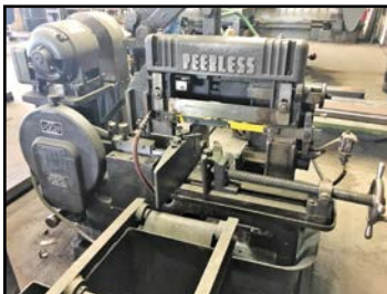
PEERLESS POWER HACKSAW