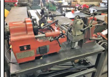
VIEW of PORTABLE THREADING MACHINE & MAGNETIC DRILL