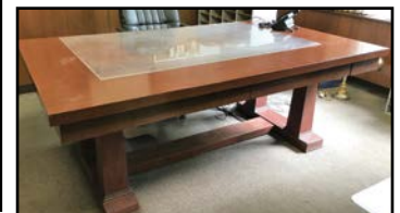
VIEW OF EXECUTIVE OFFICE DESK