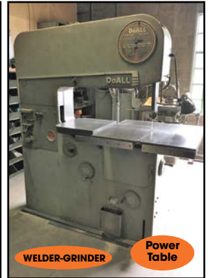
DO-ALL # 36-2 VERTICAL BAND SAW