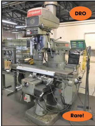
BRIDGEPORT 4 HP VERTICAL MILLING MACHINE

INSPECTION DATE: TUESDAY, OCTOBER 1ST, (9:00 AM - 4:00 PM)