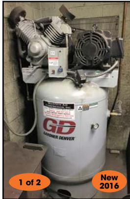
GARNDER DENVER 15 HP AIR COMPRESSOR