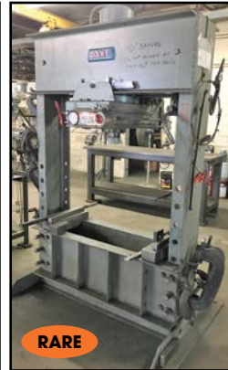
DAKE 100-Ton "AIR-HYDRAULIC" H-FRAME SHOP PRESS