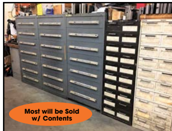
VIEW of STANLEY-VIDMAR TOOL CABINETS