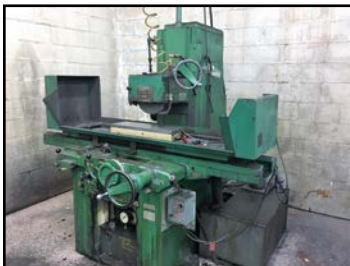
LANDIS 8"x 24" HYD. SURFACE GRINDER