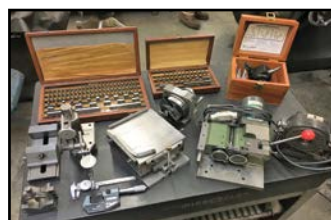
SAMPLE VIEW of HIGH QUALITY INSPECTION & GRINDING FIXTURES AVAILABLE