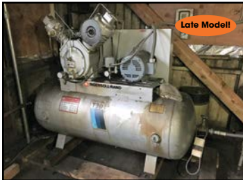
INGERSOLL-RAND 10HP AIR COMPRESSOR