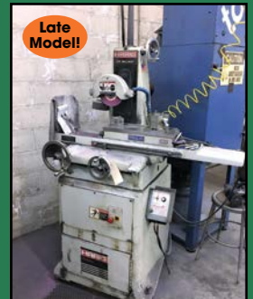
HARIG # 618-BALLWAY SURFACE GRINDER