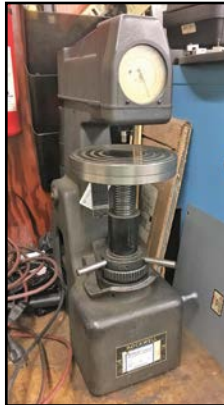
WILSON-ROCKWELL # 3-JR HARDNESS TESTER