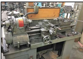
SOUTH-BEND BENCH TOP LATHE