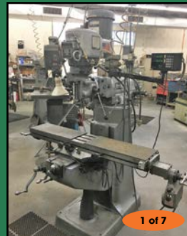
BRIDGEPORT 2 HP "Series-1" VERTICAL MILLER