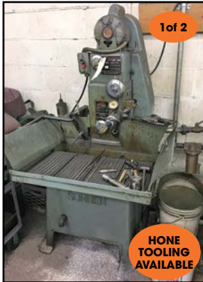
SUNNEN # MBB-1600 HONING MACHINE

INSPECTION DATE: TUESDAY, DECEMBER 3RD, (9:00 AM - 4:00 PM)