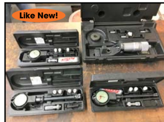
SUNNEN BORE GAGES & MASTER SETTING GAGE