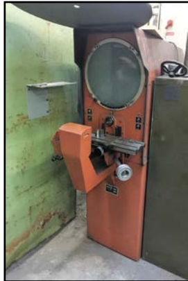
MICRO-VU 14" OPTICAL COMPARATOR