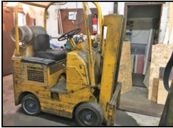
TOWMOTOR 3,000 lb. PROPANE FORKLIFT