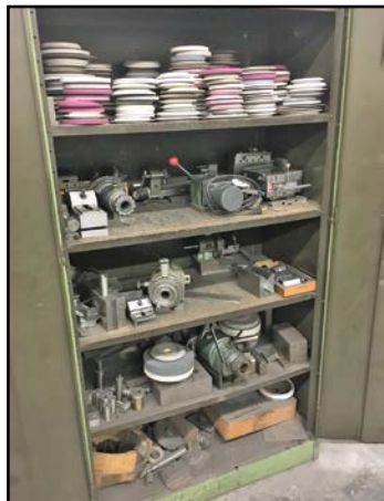
VIEW of GRINDING FIXTURES - WHEELS & More!!