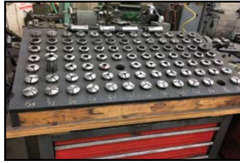
VIEW of HARDINGE 5C COLLETS