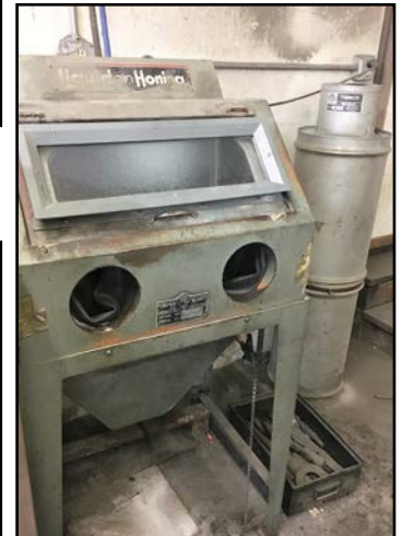
BLAST CABINET w/ Dust Collector