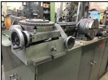
VIEW of ROTARY TABLES - FIXTURE PLATES & INDEXERS