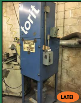
TORIT # VS-1200 DUST COLLECTOR