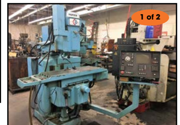
HURCO # KM-1 CNC MILLING MACHINE