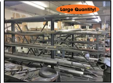
VIEW of RAW MATERIAL AVAILABLE