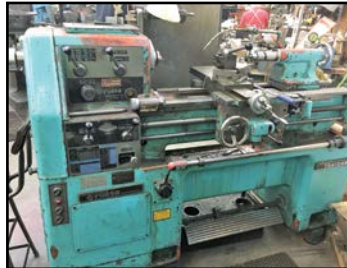
TAKISAWA 15"x 30" ENGINE LATHE