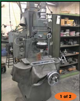
Moore # 2 JIG GRINDER

Inspection Date: TUESDAY, DECEMBER 3rd, (9:00 AM - 4:00 PM)