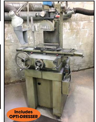
DO-ALL 6"x 12" SURFACE GRINDER