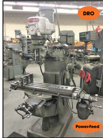
BRIDGEPORT 1.5 HP VERTICAL MILLER