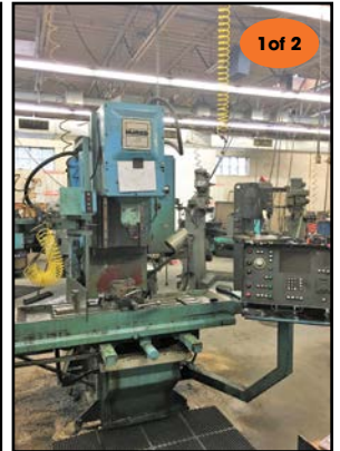
HURCO # MB-1 CNC MILLING MACHINE