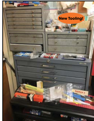
VIEW of HUOT DRILL & TOOL CABINETS