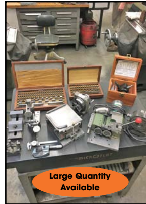
SAMPLE VIEW of HIGH QUALITY INSPECTION & GRINDING FIXTURES AVAILABLE