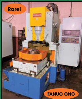
FELLOWS #20-4 CNC GEAR SHAPER