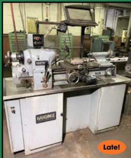
CLAUSING-KONDIA # FV-1 VERTICAL MILLING MACHINE