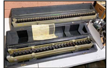
VIEW of STARRETT ULTRA-PRECISION STEP GAGES