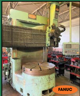
BULLARD 46" CNC VERTICAL TURRET LATHE

Inspection Date: TUESDAY, OCTOBER 6th, (9:00 AM - 4:00 PM)