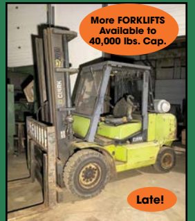
CLARK 10,000 lbs. FORKLIFT