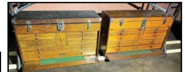
VIEW of GERSTNER TOOL BOXES