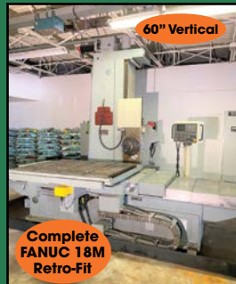
DEVLIEG #4K-60 CNC JIG-MILL