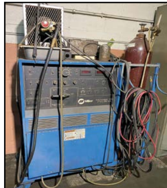
MILLER #SYNCROWAVE-350 WELDER