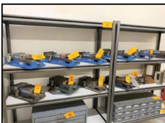
VIEW of KURT PRECISION VISES