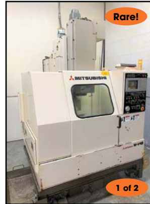
Rare! MITSUBISHI # M-5VB CNC VERTICAL MACHINING CENTER