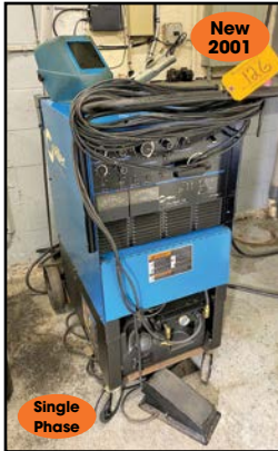
New 2001 # MILLER # SYNCROWAVE-250 TIG WELDER