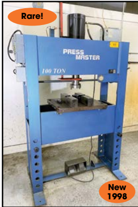
Rare! PRESSMASTER 100-Ton "H-FRAME" HYD. SHOP PRESS