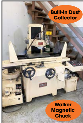
Built-In Dust Collector Walker Magnetic Chuck