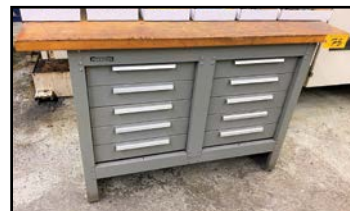
KENNEDY WOOD TOP WORKBENCH