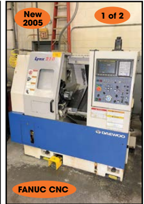
New 2005 1 of 2 DAEWOO # LYNX-210 CNC LATHE

NOTICE: Some Machine Accessories & Fixtures in Photos may be SOLD separately. Please Inspect or View Final Lot Catalog for confirmation.