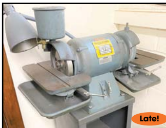
Late! BALDOR "CARBIDE" DOUBLE END TOOL GRINDER