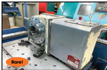
Rare! VIEW of TSUDAKOMA "4th-AXIS" ROTARY TABLE