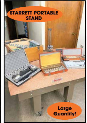
VIEW of STARRETT "PINK" GRANITE SURFACE PLATE & INSPECTION ITEMS

NOTICE: Some Machine Accessories & Fixtures in Photos may be SOLD separately. Please Inspect or View Final Lot Catalog for confirmation.