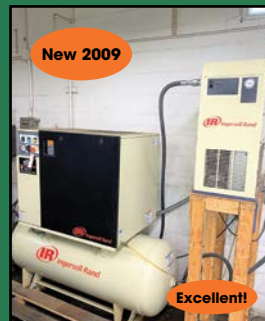
INGERSOLL-RAND 15 HP AIR COMPRESSOR & AIR DRYER