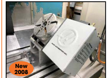
New 2008 VIEW of HAAS #HRT-210 CNC ROTARY TABLE w/ HAAS CNC CONTROL