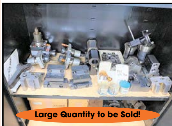
Large Quantity to be Sold!