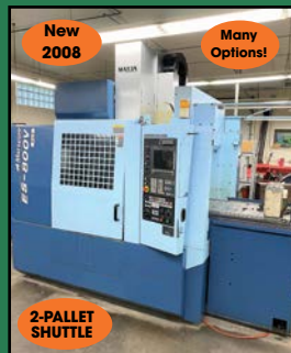
MATSUURA #ES-800-PC2 CNC "4-AXIS" VERTICAL MACHINING CENTER