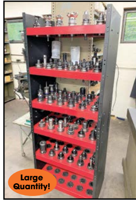
VIEW of #BT-40 CNC TOOLHOLDERS