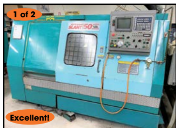
1 of 2 Excellent! METHODS #SLANT-50 CNC TURNING CENTER