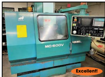
Excellent! MATSUIURA #MC-600V VERTICAL MACHINING CENTER