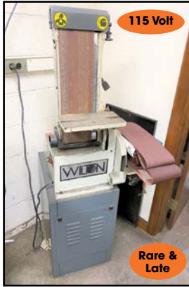
WILTON BELT/DISC SANDER