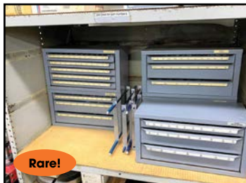
Rare! VIEW of HUOT DRILL CABINETS