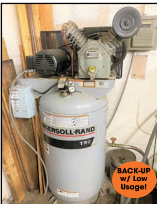
BACK-UP w/ Low Usage! INGERSOLL-RAND 5 HP AIR COMPRESSOR