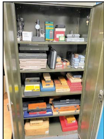
VIEW OF LARGE QUANTITY INSPECTION ITEMS - MITUTOYO - STARRETT & MORE!