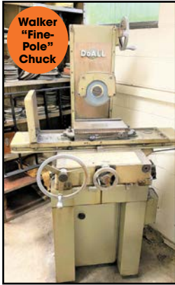
DO-ALL 6"x 12" SURFACE GRINDER

INSPECTION DATE: TUESDAY, AUGUST 10TH , (9:00 AM - 4:00 PM)