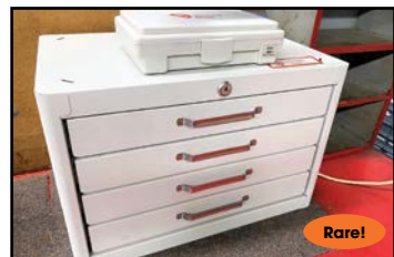
Rare! VIEW OF VERMONT AMERICAN PIN GAGES