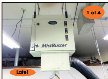
1 of 4 Late! VIEW of "MISTBUSTER" MIST COLLECTOR