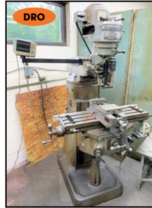
BRIDGEPORT VERTICAL MILLING MACHINE