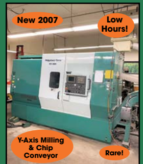
NAKAMURA-TOME #SC-300MY MILL-TURNING CENTER