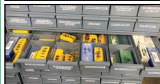
VIEW of CARBIDE ENDMILLS & INSERTS