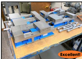
Excellent! VIEW of KURT "PRECISION" MACHINE VISES