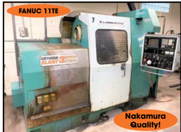
Nakamura Quality! NAKAMURA-TOME #SLANT-3 CNC TURNING CENTER