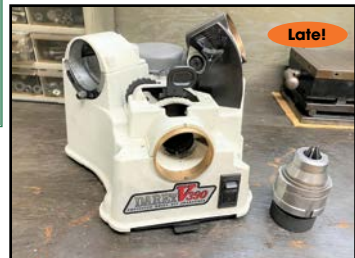
Late! DAREX #V-390 DRILL SHARPENER