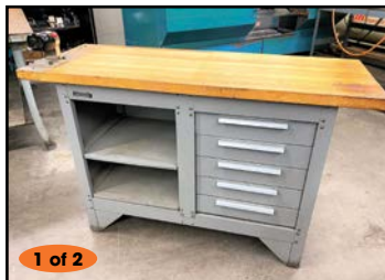
1 of 2 VIEW of KENNEDY WOODTOP WORKBENCH