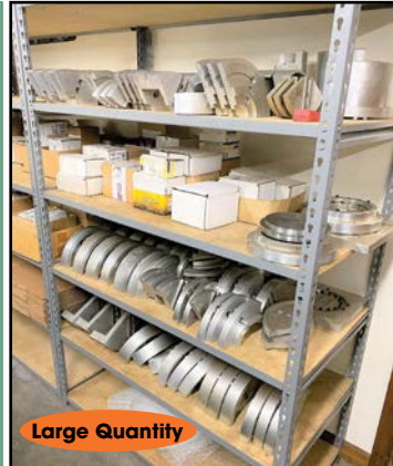
Large Quantity VIEW of ALUMINUM PIE JAWS