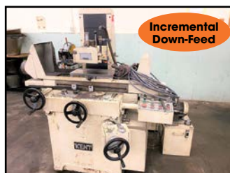
Kent #KGS-818AHD Hydraulic Surface Grinder