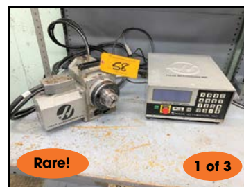
View of Haas 5C Indexer w/ Haas Control