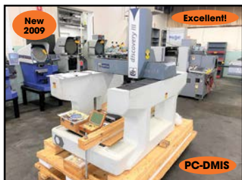
Sheffield # Discovery III-D8-U CNC CMM