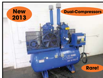
Quincy #QR-35 "Du-Plex" 2-Stage (10HP) Air Compressor