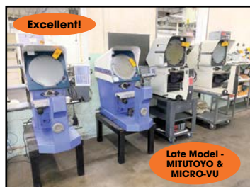
View of Optical Comparators