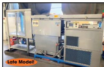
Greco S.S. Ultrasonic Vapor Parts Degreaser System