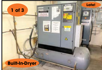
Atlas-Copco #GA-18 (25HP) Air Compressor