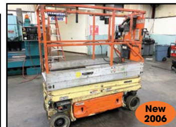
View of JLG Scissor Lift