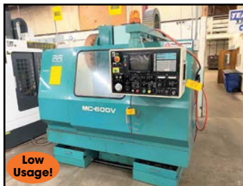
Matsuura #MC-600V CNC Vertical Machining Center