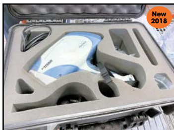
Bruker #S-1-Titan Metal Analyzing Gun