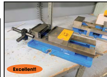
View of Kurt Vises