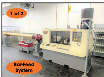
Hardinge #CHNC-III "Super Precision" CNC Lathe