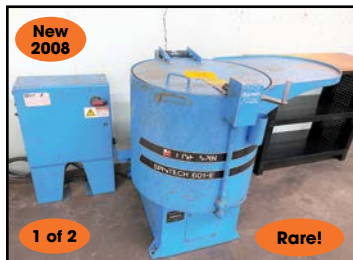
Barrett Kine-Spin #SPINTECH-601-E Chip Spinner