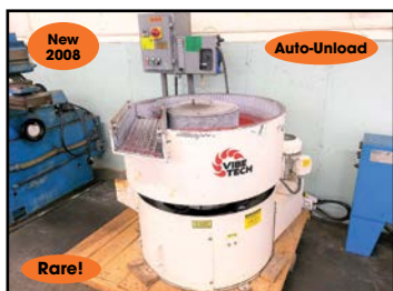
Vibe-Tech #VTG-3816 Vibratory Finishing Machine