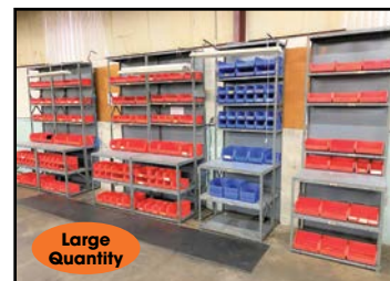
View of Metal Shelving & Akro Bins