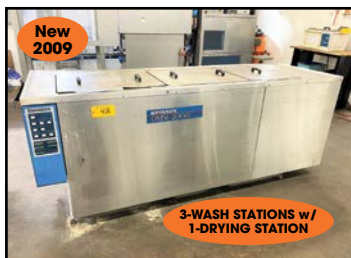
Branson #OMNI-1620 Ultrasonic Cleaning System