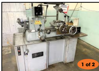
Hardinge #HC Chucker