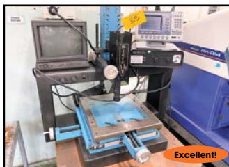
Micro-VU Video Measuring System