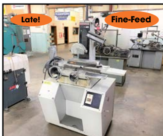
Harig #618 Surface Grinder