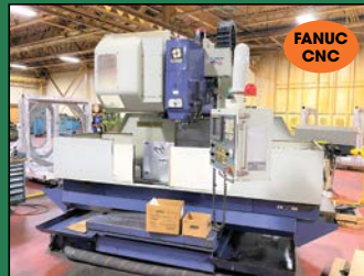
HWACHEON CNC VERTICAL MACHINING CENTER