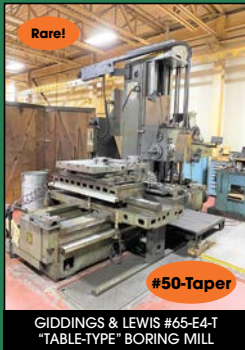
GIDDINGS & LEWIS #65-E4-T "TABLE-TYPE" BORING MILL