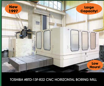
TOSHIBA #BTD-13F-R22 CNC HORIZONTAL BORING MILL