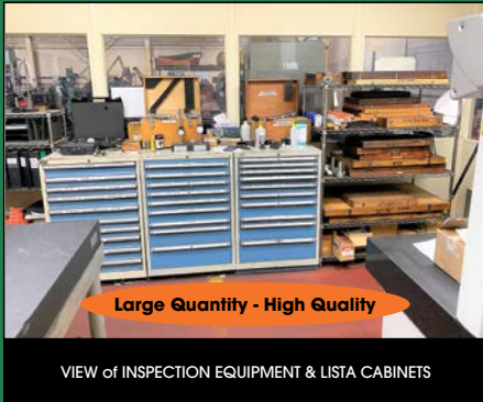
VIEW OF INSPECTION EQUIPMENT & LISTA CABINETS