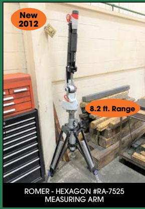
ROMER - HEXAGON #RA-7525 MEASURING ARM