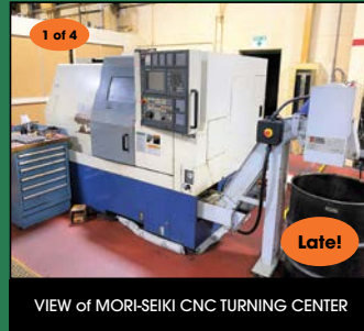
VIEW of MORI-SEIKI CNC TURNING CENTER