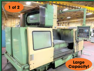
MORI-SEIKI #MV-65 CNC VERTICAL MACHINING CENTER