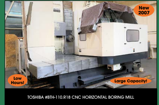
TOSHIBA #BTH-110.R18 CNC HORIZONTAL BORING MILL