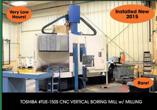
TOSHIBA #TUE-150S CNC VERTICAL BORING MILL w/ MILLING