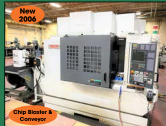
MORI-SEIKI #NV-5000 CNC VERTICAL MACHINING CENTER

CNC MACHINES AVAILABLE IMMEDIATELY Call Auctioneer