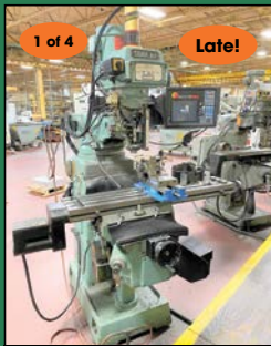
VIEW of TRAK CNC MILLER