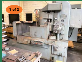
VIEW of BLANCHARD ROTARY SURFACE GRINDER