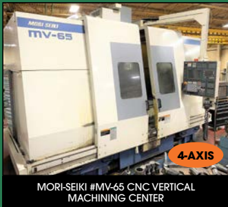
MORI-SEIKI #MV-65 CNC VERTICAL MACHINING CENTER