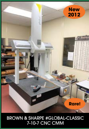
BROWN & SHARPE #GLOBAL-CLASSIC 7-10-7 CNC CMM