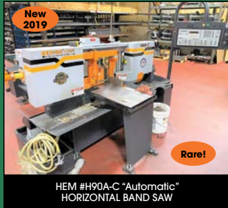
HEM #H90A-C "Automatic" HORIZONTAL BAND SAW

CNC MACHINES AVAILABLE IMMEDIATELY Call Auctioneer