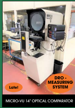
MICRO-VU 14" OPTICAL COMPARATOR