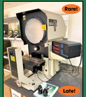
MICRO-VU #SPECTRA 14" OPTICAL COMPARATOR