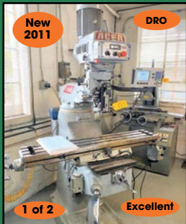
ACER #EVS-3VS-II (3HP) VERTICAL MILLING MACHINE