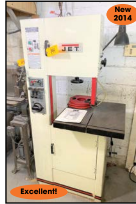
New 2014 Excellent! JET #VBS-1610 VERTICAL BAND SAW