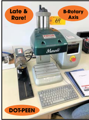
Late & Rare! B-Rotary Axis DOT-PEEN PRYOR-MONDE #MARKTRONIC-MATE CNC MARKING MACHINE