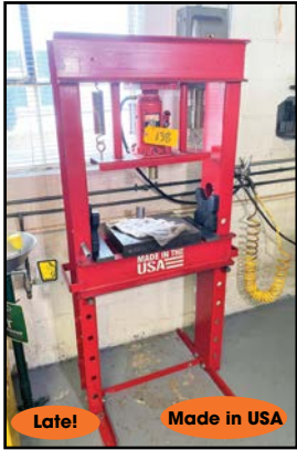
Late! Made in USA SUNEX-HD #5720AH (20-TON) HYDRAULIC SHOP PRESS

INSPECTION DATE: TUESDAY, MARCH 29TH, (9:00 AM - 4:00 PM)