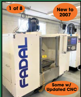
VIEW of FADAL CNC VERTICAL MACHINING CENTER

Inspection Date: Tuesday, March 29th, (9:00 AM - 4:00 PM)