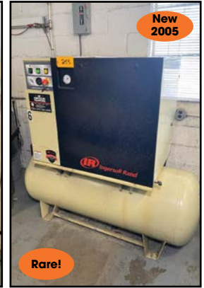
New 2005 Rare! INGERSOLL-RAND 10HP "SCREW-TYPE" AIR COMPRESSOR