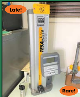
TESA-HEXAGON #TESA-HITE-400 DIGITAL HEIGHT GAGE