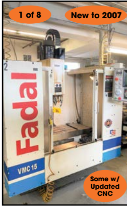
1 of 8 New to 2007 Some w/ Updated CNC VIEW of FADAL CNC VERTICAL MACHINING CENTER