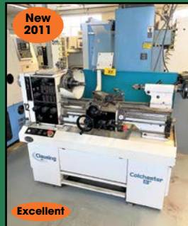
CLAUSING 13"/"18" x 25" GAP-TYPE ENGINE LATHE