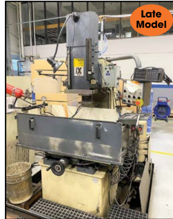
XERMAC #X-20 "SINKER-TYPE" EDM