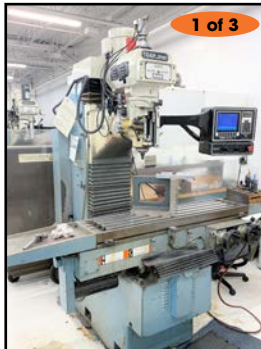
SWI TRAK #DPM-5 CNC VERTICAL MILLER