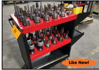
VIEW OF HAIMER #HSK-63 CNC TOOLHOLDERS