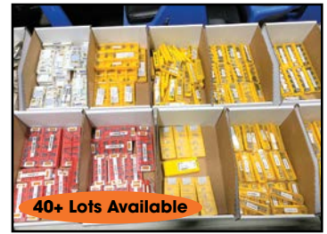
VIEW OF (NEW) CARBIDE INSERTS & ENDMILLS