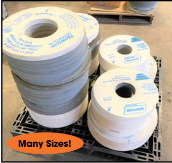
VIEW OF (NEW) GRINDING WHEELS