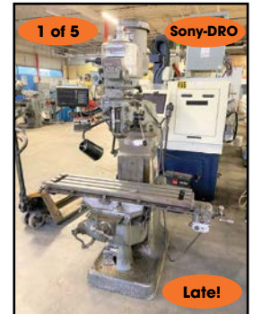
BRIDGEPORT 2HP "SERIES-1" VERTICAL MILLING MACHINE