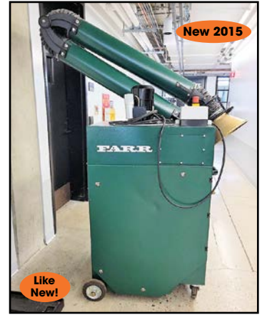
FARR #Zephyr-III Portable Fume and Dust Collector