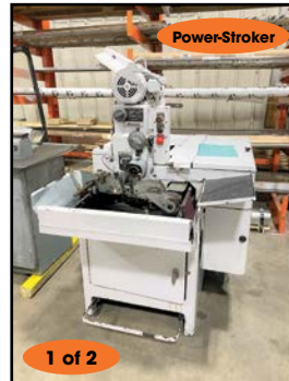
SUNNEN #MBB-1800E HONING MACHINE