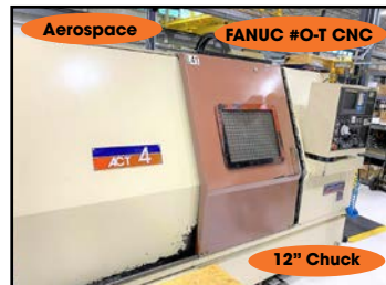
OKUMA & HOWA #ACT-4 CNC LATHE