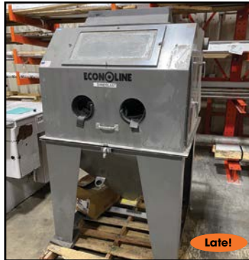
ECONOLINE BLAST CABINET