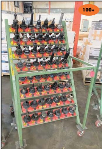
VIEW OF #CAT-50 CNC TOOLHOLDERS