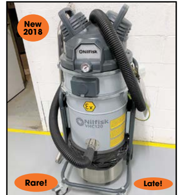
NILFISK #VHC-120 VACUUM