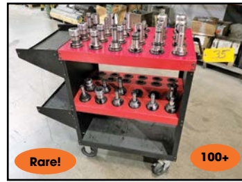
VIEW OF #CAT-40 LYNDEX-NIKKEN CNC TOOLHOLDERS