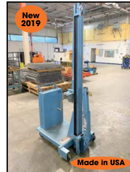
DAVID-ROUND 550lb. PORTABLE CRANE