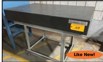
DO-ALL 30"x 48" (GRADE-A) GRANITE SURFACE PLATE