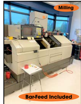
CITIZEN #E-32 "SWISS-TYPE" CNC LATHE