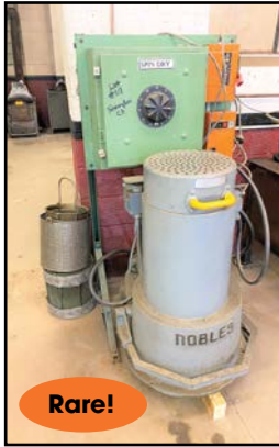
Rare! NOBLES CHIP SPINNER