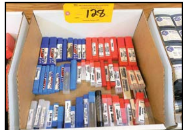
VIEW of NEW CARBIDE TOOLING