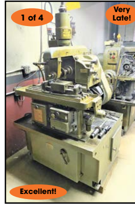
1 of 4 Very Late! Excellent! CINCINNATI #0-12 "RISE & FALL" PRODUCTION MILLER