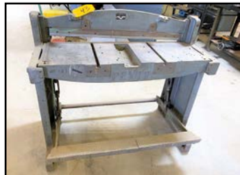
PEXTO & WILCOX 36" FOOT SHEAR