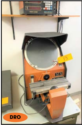
DRO MICRO-VU #M-12 OPTICAL COMPARATOR