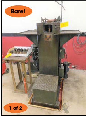
Rare! 1 of 2 PIONEER 4-Ton VERTICAL HYD. BROACHING MACHINE