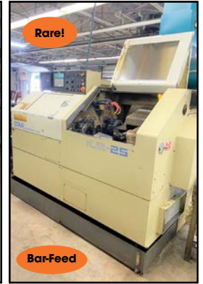
Rare! Bar-Feed STAR #KJR-25 "SWISS-TYPE" CNC LATHE