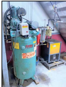
GEARCO 5HP AIR COMPRESSOR & ZEKs AIR DRYER