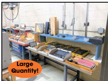
VIEW of INSPECTION ITEMS