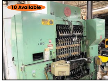
WATERBURY-FARREL #20-12 TRANSFER PRESS