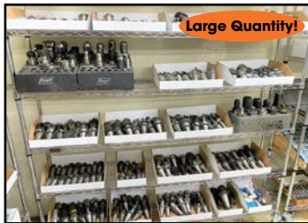
VIEW of #CAT-40 & #CAT-50 CNC TOOLHOLDERS