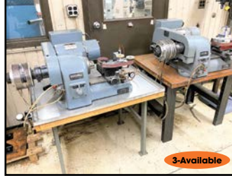
VIEW of HARDINGE #HSL SPEED LATHES