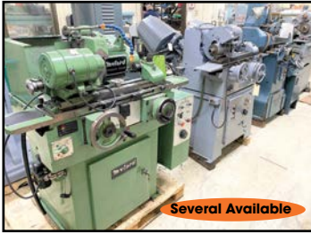
VIEW of CYLINDRICAL GRINDERS

SALE DATE: WEDNESDAY, APRIL 12TH , 11:00 AM (ET)