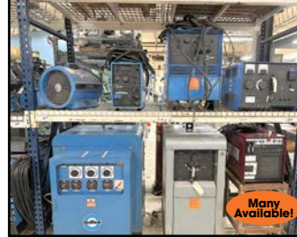
VIEW of WELDERS