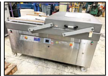
ALINE #DC-800-S HEAT SEAL PACKAGING MACHINE

2 ONLINE AUCTION — REGISTER & BID AT www.DIAUCTIONS.com