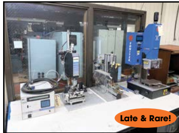
VIEW of PRECISION WELDERS