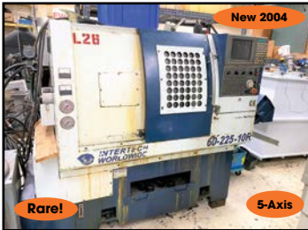
INTERTECH #60-225-10R CNC LATHE