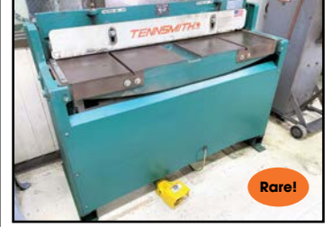
TENNSMITH #H-52 (16G) POWER SHEAR