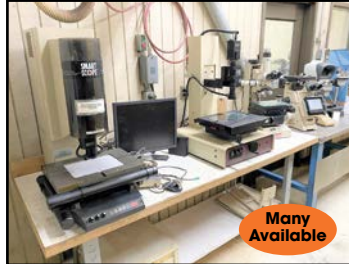
VIEW of SMART SCOPE & VIDEO INSPECTION ITEMS