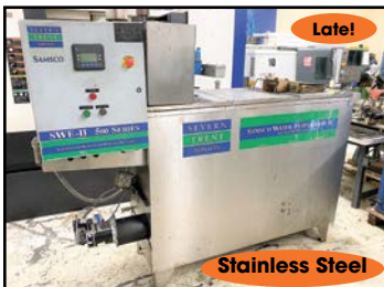
SAMSCO #SWE-II-500 WATER-COOLANT EVAPORATOR