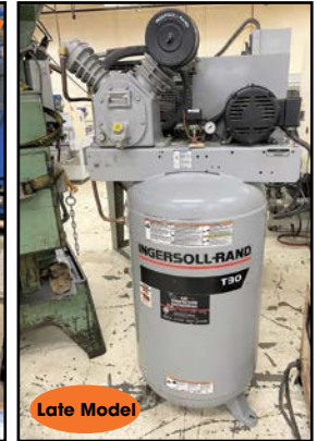
INGERSOLL-RAND 5HP AIR COMPRESSOR