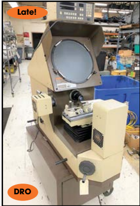
MITUTOYO #PH-350 OPTICAL COMPARATOR