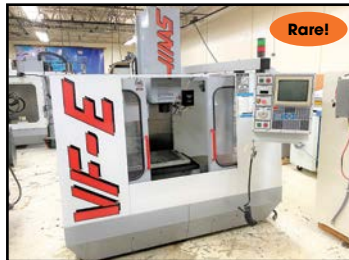
HAAS #VF-E CNC VERTICAL MACHINING CENTER