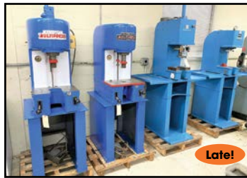
VIEW of DENISON HYD. PRESSES