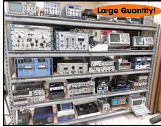
VIEW of ELECTRONIC TEST ITEMS