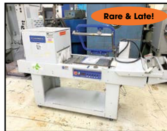
CLAMCO #120/220 SHRINK PACKAGING SYSTEM