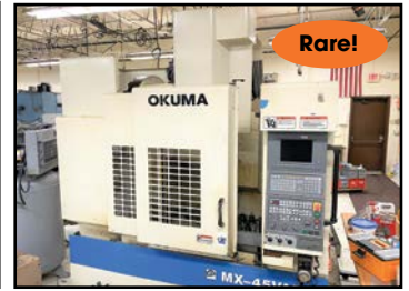
OKUMA #MX-45VAE CNC VERTICAL MACHINING CENTER