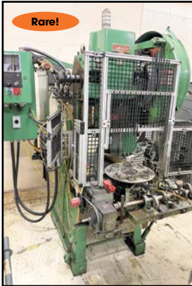
V&O NOTCHING PRESS