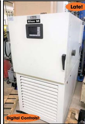
BLUE M LABORATORY OVEN