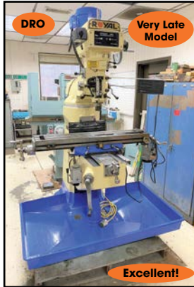
ROYAL 3HP VERTICAL MILLING MACHINE