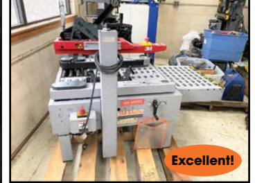
3M-MATIC #A-80 CASE SEALING MACHINE