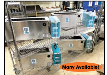
VIEW OF (NEW) CREST ULTRASONIC CLEANERS