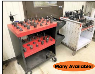
VIEW of CNC TOOLHOLDERS