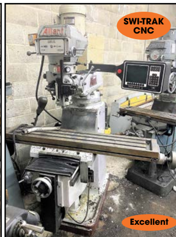
BRIDGEPORT-HARDINGE "SERIES-1" 2HP VERTICAL MILLER