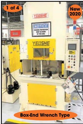
YEUSHE HYDRAULICS #MA-20-800-A BROACHING MACHINE