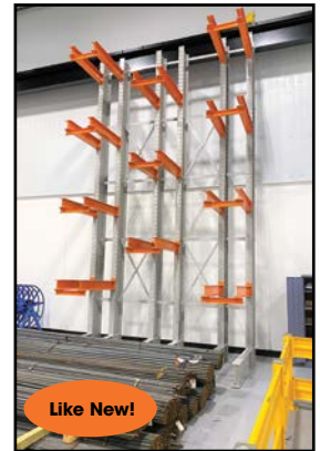
H.D. CANTILEVER "COIL-TYPE" STORAGE RACK