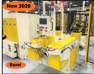
KEYENCE #VL-5070 3D SCANNER-MEASURING CMM