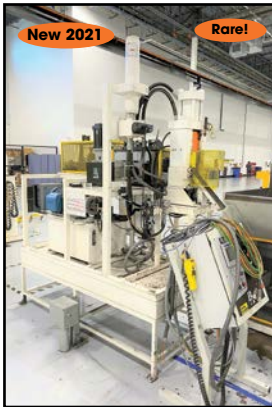
PA SYSTEMS FORGING FEED & BILLET SHEAR SYSTEM