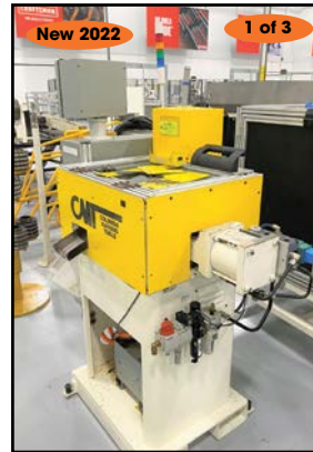
COLUMBIA ROLL-TYPE PARTS MARKING MACHINE