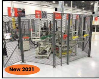
DMP #FP-1000G32L FILTER PRESS