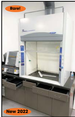
VIEW of LAB HOOD & FISCHERSCOPE X-RAY SYSTEM