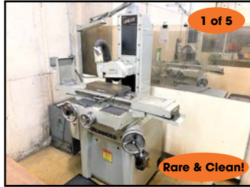
1 of 5 Rare & Clean! OKAMOTO #LINEAR-618 SURFACE GRINDER