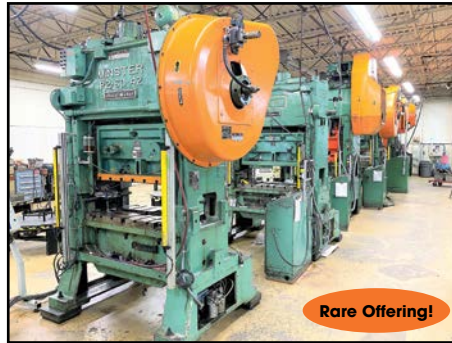
VIEW of MINSTER STAMPING PRESSES