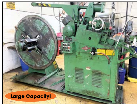
LITTELL #412-5 COIL-FEED/STRAIGHTENER