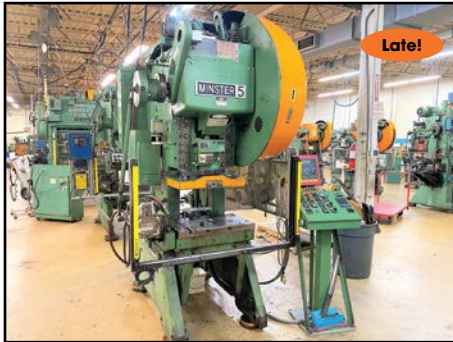
MINSTER #5 OBI PUNCH PRESS