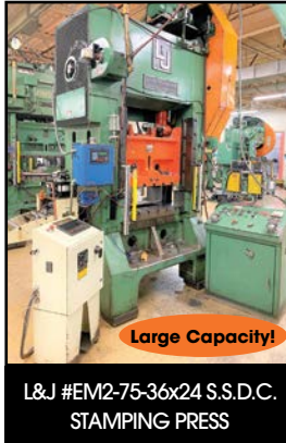
L&J #EM2-75-36x24 S.S.D.C. STAMPING PRESS