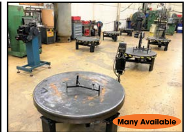
Many Available VIEW of COILMATE MATERIAL UNCOILERS