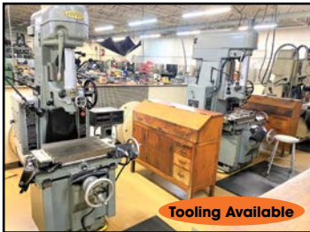
Tooling Available VIEW of MOORE JIG BORERS & TOOL CABINETS