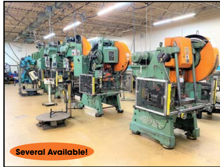
VIEW of V&O OBI PUNCH PRESSES