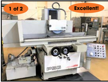
1 of 2 Excellent! OKAMOTO #ACCUGAR-124DX HYD. 12"x 24" SURFACE GRINDER