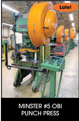
MINSTER #5 OBI PUNCH PRESS

INSPECTION: Tuesday, October 10th, (9:00 - 4:00)