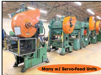
Many w/ Servo-Feed Units VIEW of MINSTER STAMPING PRESSES