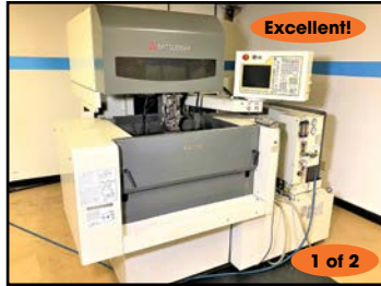
Excellent! 1 of 2 MITSUBISHI #FA-10S CNC WIRE EDM