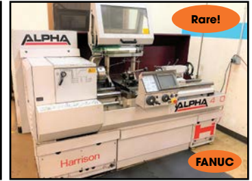
Rare! FANUC HARRISON #ALPHA-400 CNC LATHE