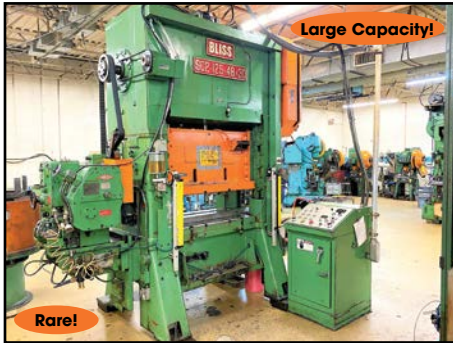
BLISS #SC2-125-48x30 S.S.D.C. STAMPING PRESS