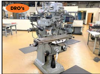
DRO's VIEW of BRIDGEPORT "SERIES-I" 2HP VERTICAL MILLER