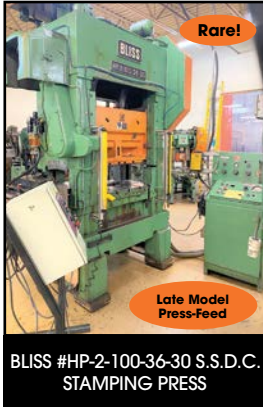
BLISS #HP-2-100-36-30 S.S.D.C. STAMPING PRESS