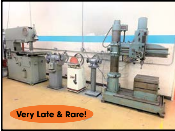
Very Late & Rare! VIEW of ARBOGA #RLM-3512 RADIAL DRILL & TOOL GRINDERS