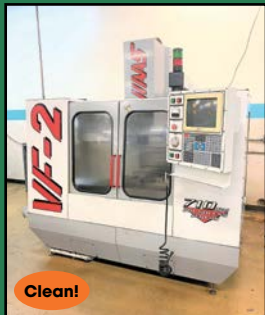
HAAS #VF-2 CNC VERTICAL MACHINING CENTER