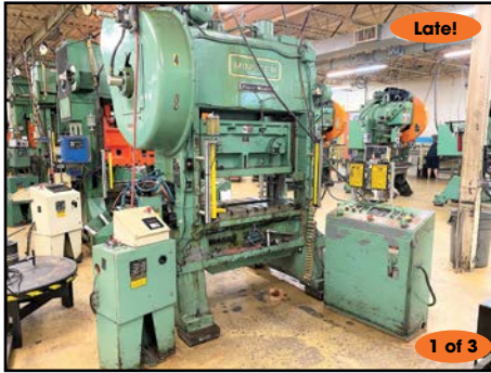
MINSTER #P2-60-48 S.S.D.C. STAMPING PRESS