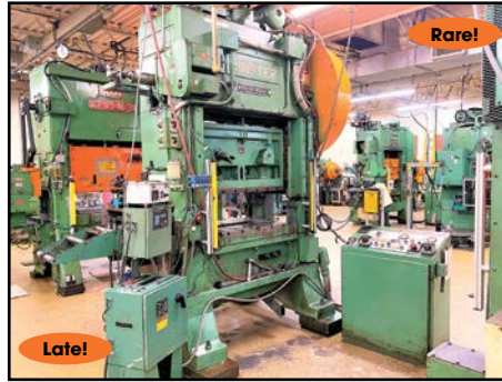
MINSTER #P2-100-48 S.S.D.C. STAMPING PRESS