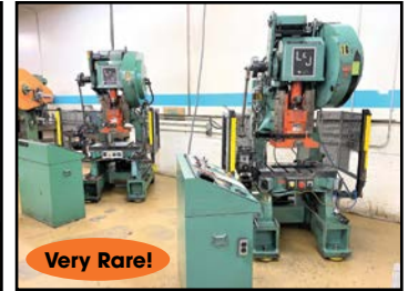
Very Rare! VIEW of L&J #W-27 (27-Ton) "SPEED-STAMPER" PRESSES