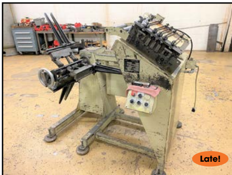
COOPER-WEYMOUTH "DICKERMAN" #12-CRS COIL-FEED/STRAIGHTENER