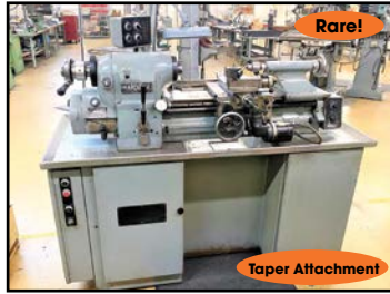
Rare! Taper Attachment HARDINGE #HLV-H "PRECISION" TOOLROOM LATHE