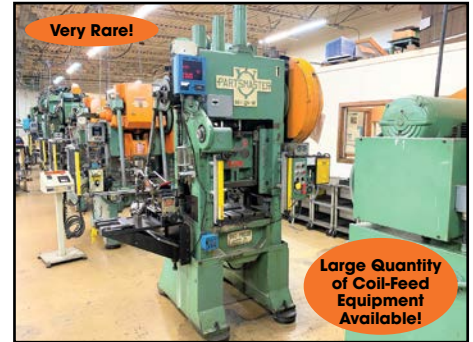
V&O #SS-1-25-18 "PARTS-MASTER" STRAIGHT-SIDE PRESS