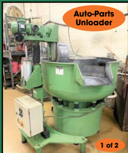
ROSLER #R-420-TRM VIBRATORY FINISHING BOWL