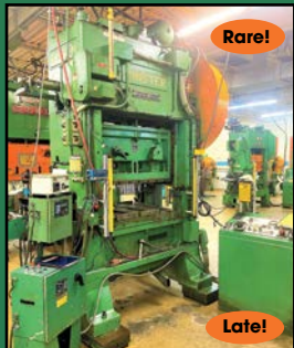
MINSTER #P2-100-48 S.S.D.C. STAMPING PRESS

INSPECTION: Tuesday, October 10th, (9:00 AM - 4:00 PM)