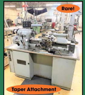
HARDINGE #HLV-H PRECISION TOOLROOM LATHE