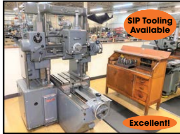
SIP Tooling Available Excellent! SIP #MP-3K PRECISION JIG BORER