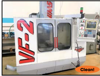
Clean! HAAS #VF-2 CNC VERTICAL MACHINING CENTER