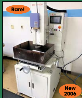
MITSUBISHI #ED-2000M CNC "HOLE-POPPER" EDM DRILL