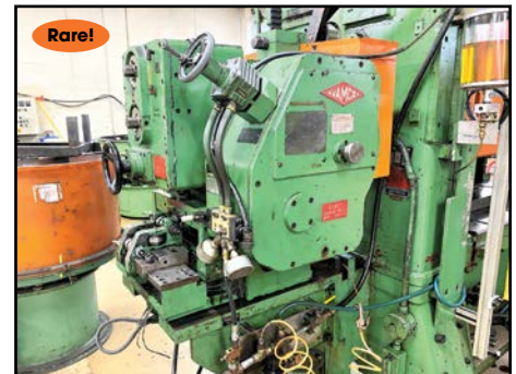
VIEW of VAMCO PRESS FEED