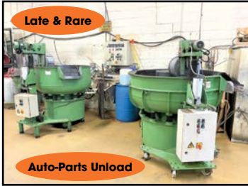
Late & Rare Auto-Parts Unload VIEW of ROSLER VIBRATORY FINISHING BOWLS