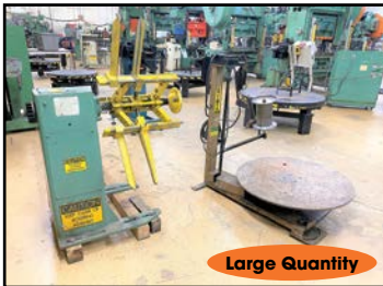
Large Quantity VIEW of COIL-FEED EQUIPMENT