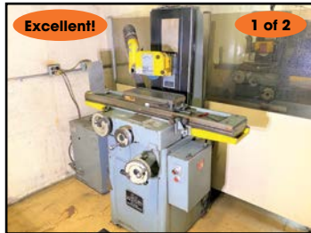
Excellent! 1 of 2 WCI-REID 6"x 18" SURFACE GRINDER