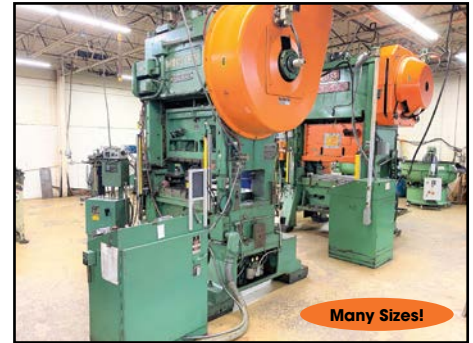
VIEW of MINSTER & BLISS S.S.D.C. STAMPING PRESSES