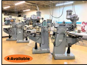
4-Available VIEW of BRIDGEPORT "SERIES-I" 2HP VERTICAL MILLERS