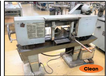
Clean DO-ALL #C-4 HORIZONTAL BAND SAW