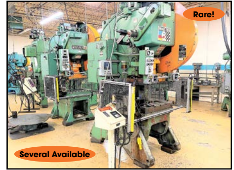
VIEW of MINSTER #6 & #5 STAMPING PRESSES