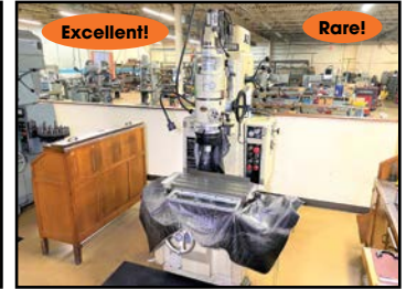
Excellent! Rare! MOORE #G-18 JIG GRINDER