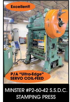
MINSTER #P2-60-42 S.S.D.C. STAMPING PRESS