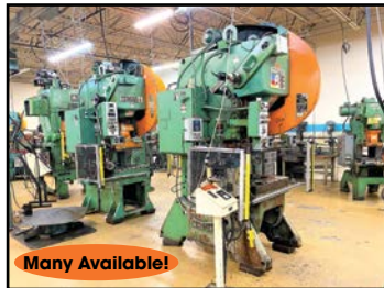
Many Available! VIEW of MINSTER #6 & #5 STAMPING PRESSES