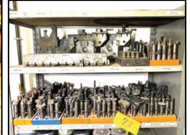
VIEW OF 3R WIRE EDM TOOLING