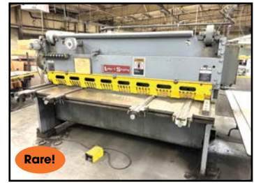
Rare! LODGE & SHIPLEY 8'x 1/4" POWER SHEAR