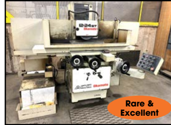
Rare & Excellent OKAMOTO 12"x 24" HYD. SURFACE GRINDER