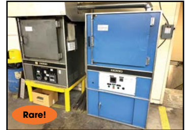
Rare! VIEW of BLUE-M OVENS