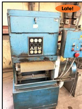
Late! AEM 24" BELT FINISHING MACHINE