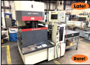
Late! Rare! MITSUBISHI #MD+PRO-II CNC WIRE EDM