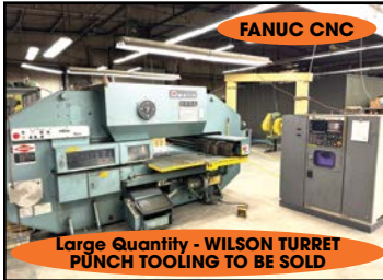
FANUC CNC Large Quantity - WILSON TURRET PUNCH TOOLING TO BE SOLD AMADA #PEGA-30/40/40 CNC TURRET PUNCH