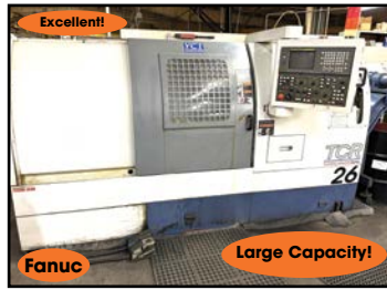
Excellent! Fanuc Large Capacity! YCM #TCR-26 CNC TURNING CENTER