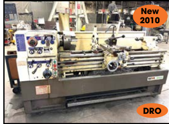
New 2010 DRO VICTOR #1660S "GAP-TYPE" ENGINE LATHE