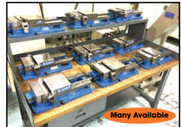
Many Available VIEW of KURT MACHINE VISES