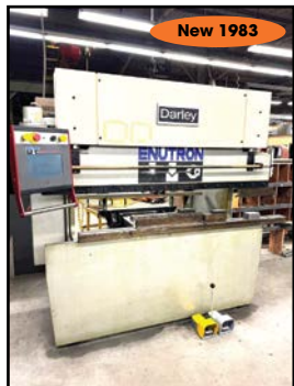
New 1983 DARLEY #EHP-35 (35-Ton) 8' CNC HYD. PRESS BRAKE