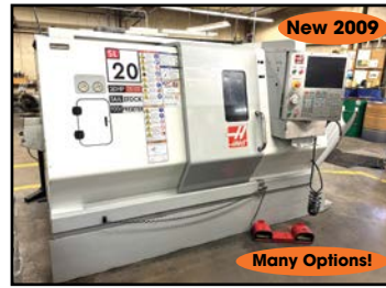
New 2009 Many Options! HAAS #SL-20T CNC TURNING CENTER