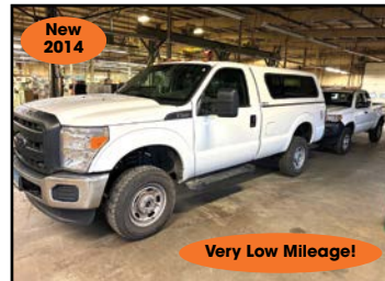
New 2014 Very Low Mileage! VIEW of PICK-UP TRUCKS