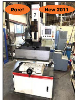
Rare! New 2011 MITSUBISHI #ED-2500M EDM "HOLE POPPER"