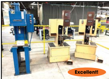
Excellent! VIEW of HAGER HARDWARE INSERTION PRESSES