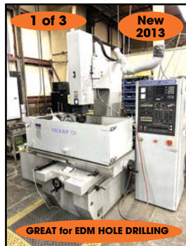
1 of 3 New 2013 GREAT for EDM HOLE DRILLING SHARP #AZ-75DR ZNC "SINKER-TYPE" EDM