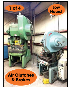
1 of 4 Low Hours! Air Clutches & Brakes VIEW of OBI PUNCH PRESSES