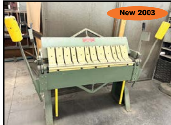
New 2003 NATIONAL 4'x 14G. "BOX & PAN" BRAKE