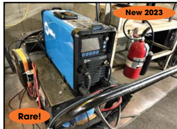
New 2023 Rare! MILLER #DYNASTY-210 "TIG" WELDER SYSTEM