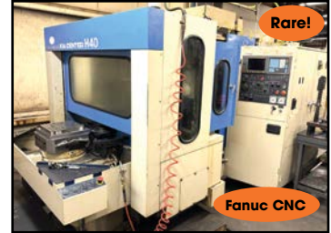
Rare! FANUC CNC KIA #KIACENTER-40 CNC HMC