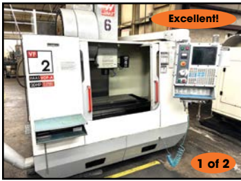
Excellent! 1 of 2 HAAS #VF-2B CNC VERTICAL MACHING CENTER