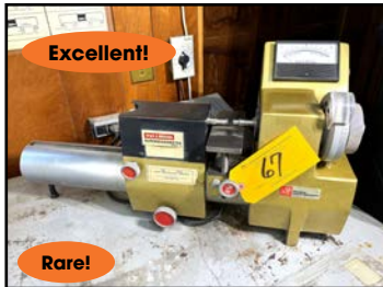
PRATT & WHITNEY #B SUPER-MICROMETER