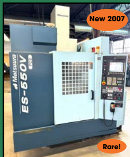
MATSUURA # ES-550V-PC2 CNC VERTICAL MACHINING CENTER