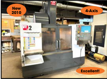
HAAS #VF-2D CNC VERTICAL MACHINING CENTER