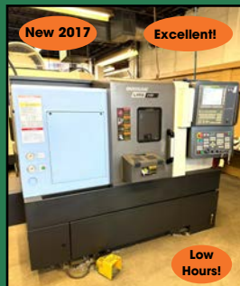
DOOSAN #LYNX-2100A CNC TURNING CENTER

Inspection Date: Tuesday, April 16th, (9:00 AM - 3:00 PM)