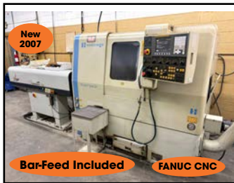
HARDINGE #Talent-6/45-SV CNC TURNING CENTER