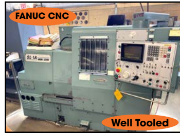
MORI-SEIKI #SL-1A CNC TURNING CENTER