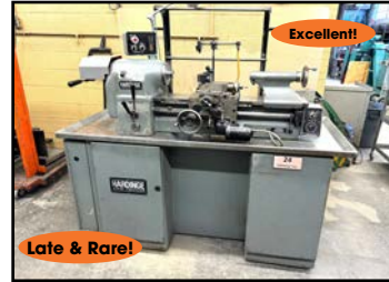
HARDINGE #HLV-TFB 12" X 20" PRECISION TOOLROOM