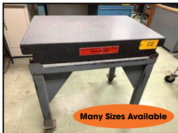
BROWN & SHARPE 24" X 36" GRANITE SURFACE PLATE