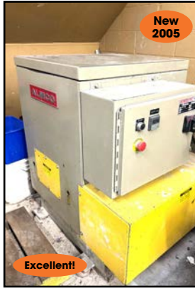
ALMCO #VB-1615 VIBRATORY PARTS FINISHING MACHINE