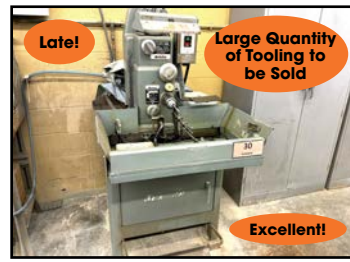
SUNNEN #MB-1650-MS HONING MACHINE