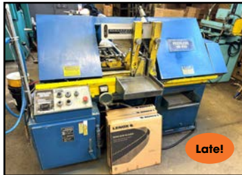
PEERLESS #HB-1012A "AUTOMATIC" BAND SAW