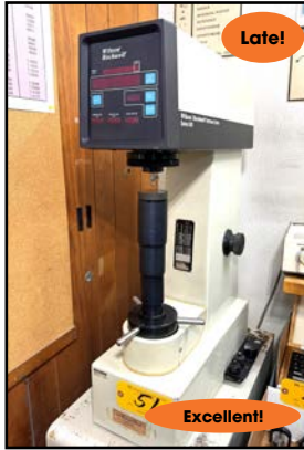
WILSON-ROCKWELL #500 DIGITAL HARDNESS TESTER