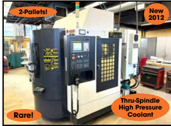
FEELER #VMP-580APC CNC VERTICAL MACHINING CENTER