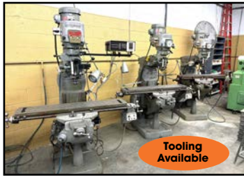
BRIDGEPORT VERTICAL MILLING MACHINES