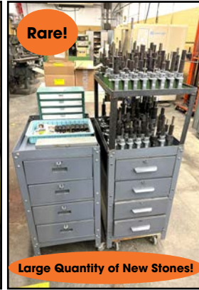
VIEW OF SUNNEN HONE TOOLING