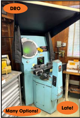
J&L EPIC-114 OPTICAL COMPARATOR

INSPECTION DATE: TUESDAY, APRIL 16TH, (9:00 AM - 3:00 PM)