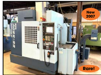
MATSUIRA # ES-550V-PC2 CNC VERTICAL MACHINING CENTER