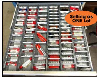
(14) DRAWERS - (NEW) CARBIDE TOOLING - DRILLS & TAPS