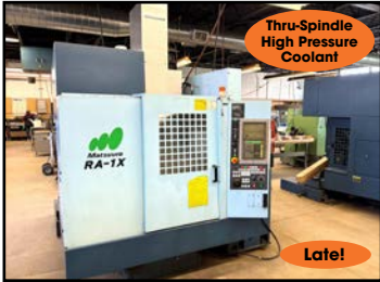
MATSUIRA # RA-1X CNC VERTICAL MACHINING CENTER