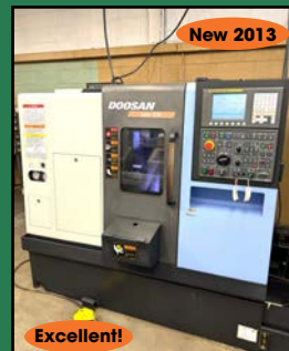
DOOSAN #LYNX-220A CNC TURNING CENTER