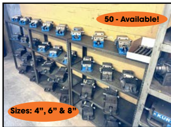
VIEW OF KURT VISES