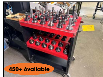
VIEW OF #CAT-40 CNC TOOLHOLDERS