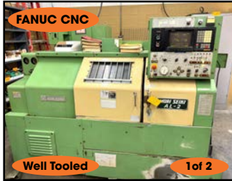
MORI-SEIKI #AL-2-ATM CNC TURNING CENTER