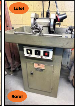
HOFMANN #AB-175 "SWISS-TYPE" CARBIDE GRINDER