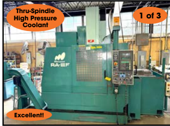
MATSUIRA # RA-III-F CNC "4-Axis" VERTICAL MACHINING CENTER