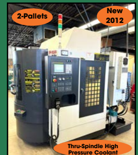
FEELER #VMP-580APC CNC VERTICAL MACHINING CENTER