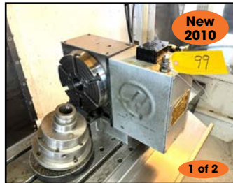
HAAS #HRT-210 "4th-AXIS" ROTARY TABLE