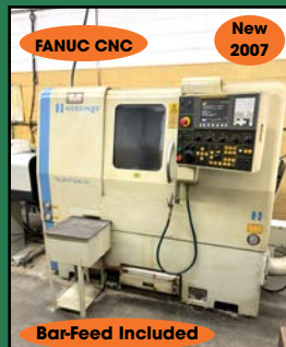
HARDINGE #Talent-6/45-SV CNC TURNING CENTER