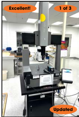
BROWN & SHARPE #GAGE-2000 CMM