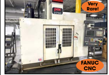
MONARCH #PMC-V750 "4th-AXIS" CNC VERTICAL MACHINING CENTER