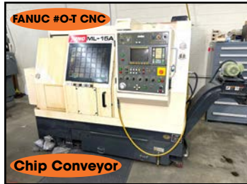
YANG #ML-15A CNC TURNING CENTER