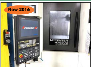
KITAMURA #MYCENTER-HX-630G CNC HORIZONTAL MACHINING CENTER