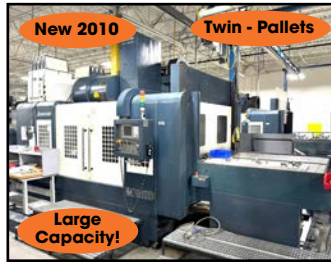
JOHNFORD #VMC-1600HD CNC VERTICAL MACHINING CENTER