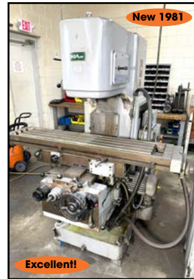
KIA MACHINE TOOLS #2MF-V VERTICAL MILLER