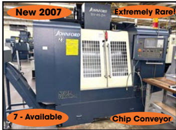
JOHNFORD #SV-45-2H CNC "TWIN-SPINDLE" VERTICAL MACHINING CENTER