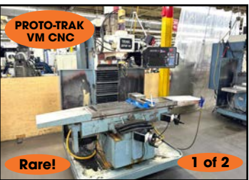
SWI-TRAK-DPM-V5 CNC BED-MILL