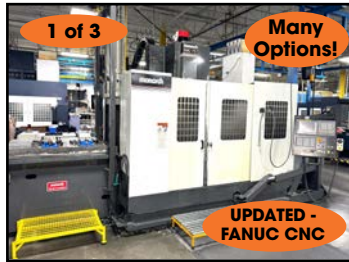
MONARCH #VMC-75 CNC VERTICAL MACHINING CENTER