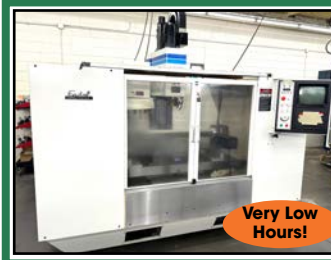
FADAL #VMC-4020HT CNC VERTICAL MACHINING CENTER w/ VIEW of FADAL "5-AXIS"