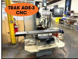
SWI-TRAK #DPM CNC BED-MILL