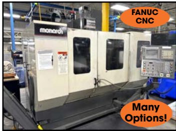
MONARCH #VMC-45B CNC VERTICAL MACHINING CENTER