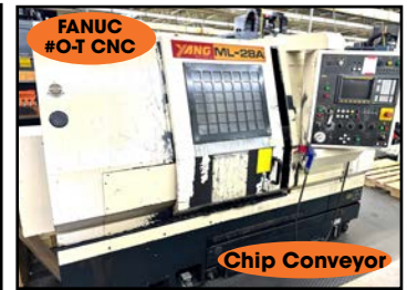
YANG #ML-28A CNC TURNING CENTER