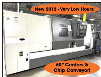
SAMSUNG (SMEC) #SL-35A/1500 CNC TURNING CENTER