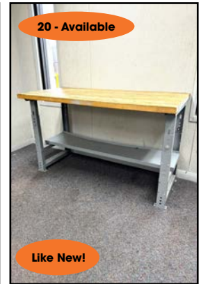
VIEW OF "BUTCHER-BLOCK" WORKBENCHES