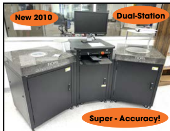
TROPEL-CORNING #FLATMASTER-MSP Light-Gage Measuring System