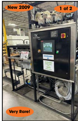
TIYODA-SERAC "VACUUM" VAPOR DEGREASER