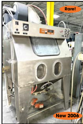
PRESSURE BLAST MFG. #AA-45 S.S. BLAST CABINET